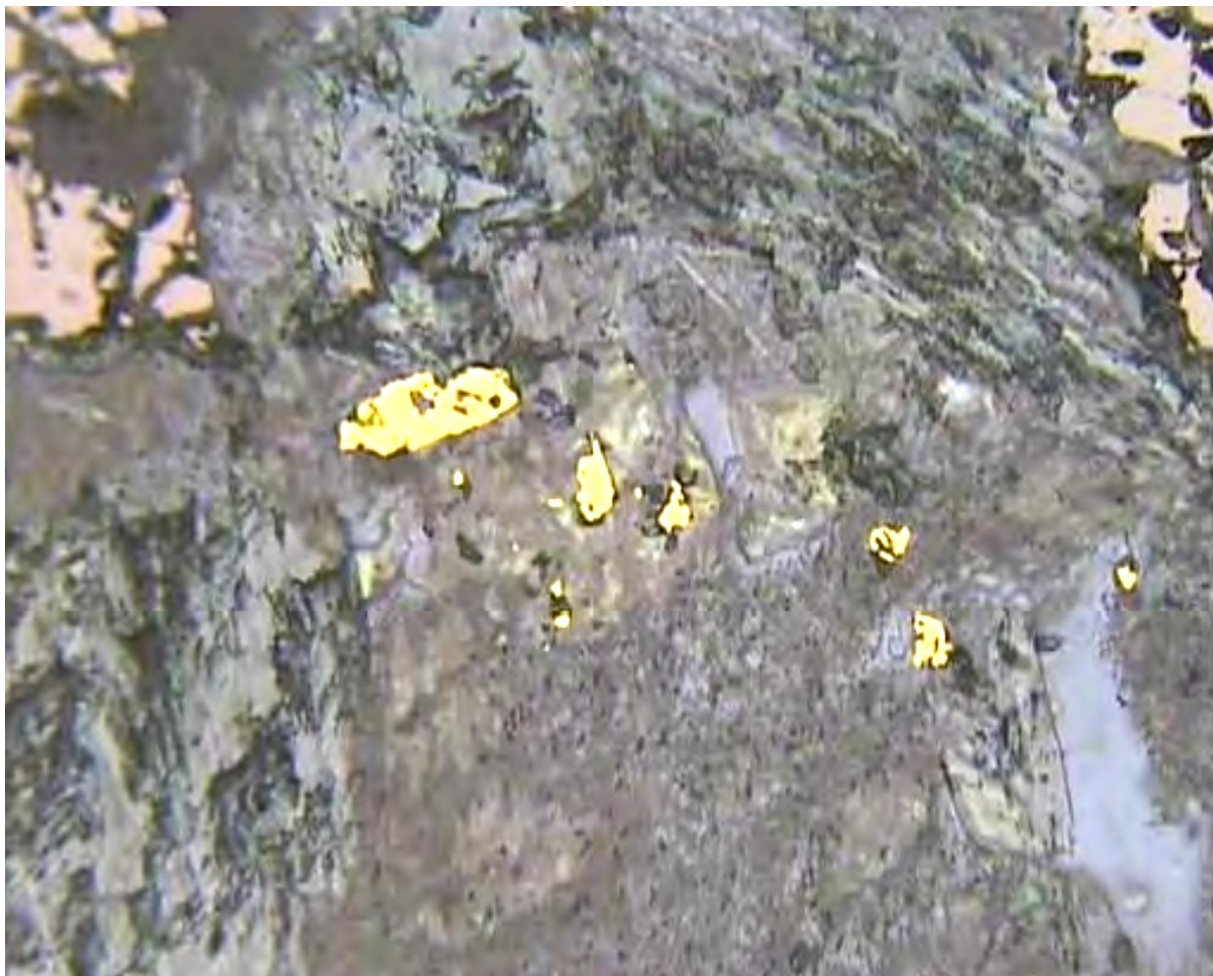
Figure 2: photomicrograph of sample 1370002.20 from 1,295.2 metres, showing fine grained chalcopyrite intergrown with secondary propylitic-style alteration minerals. Whilst only present in trace quantities, the importance of the intergrowth of chalcopyrite with distal porphyry-style late magmatic/hydrothermal stage alteration minerals is that it suggests that the parent intrusion (the source of these QDP dykes) is fertile (ie, enriched in metals, sulphur and water) and has produced a late stage metal and sulphur-rich fluid of the kind which can form copper and/or gold enriched zones.

Detailed petrographic studies of numerous samples have also confirmed that the copper occurs as disseminated fine grained chalcopyrite intergrown with other secondary alteration minerals including chlorite, amphibole, epidote, pyrite, magnetite, albite and hematite (see Figure 2). This assemblage indicates that the chalcopyrite formed from late hydrous magmatic to early prograde hydrothermal fluids, which is consistent with how porphyry copper mineralisation is typically formed.