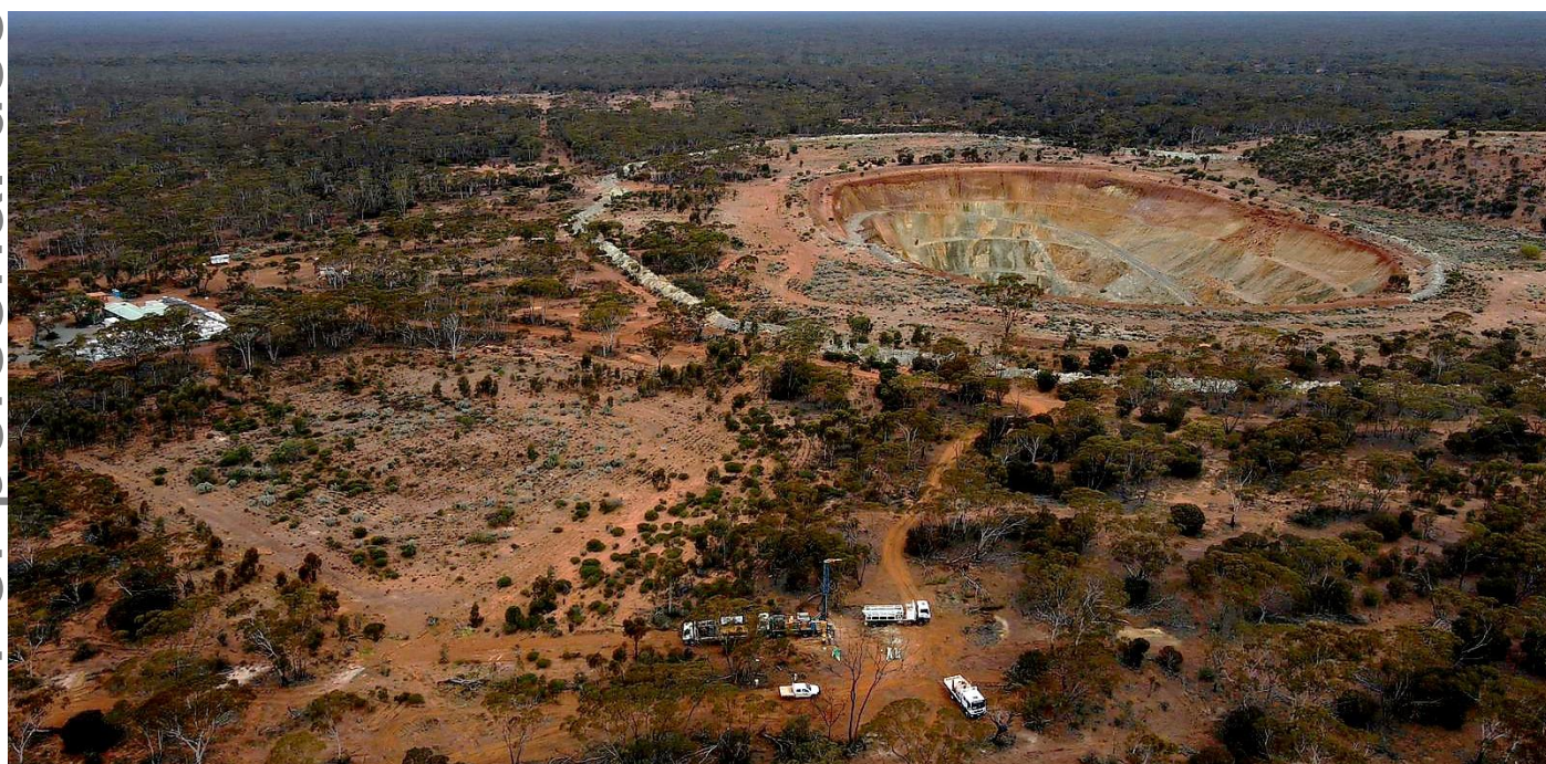
Figure 1 – RC drilling at Maximus' 8500N Paleochannel southern extents with Wattle Dam open pit in the background (looking south).

Maximus Resources Limited ('Maximus' or the 'Company', ASX:MXR) is pleased to advise shareholders of the completion of the first-phase Reverse Circulation (RC) drill program at the 8500N Paleochannel ( 8500N ) (100% Maximus) and additional resource infill holes at Hilditch gold deposit ( Hilditch ) (90% Maximus), located 25km from Kambalda, Western Australia.