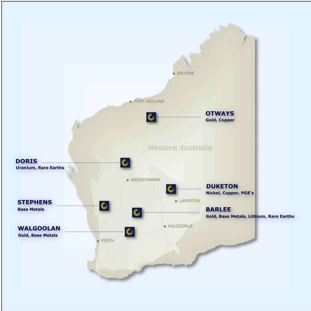
Figure 3: Duketon Regional Tenements