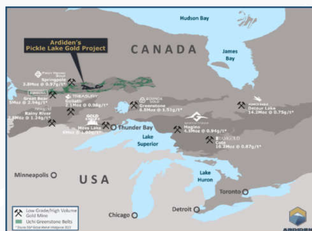
Figure 1– Location of Ardiden's Pickle Lake Gold project within the Uchi Belt of northwest Ontario 1 .