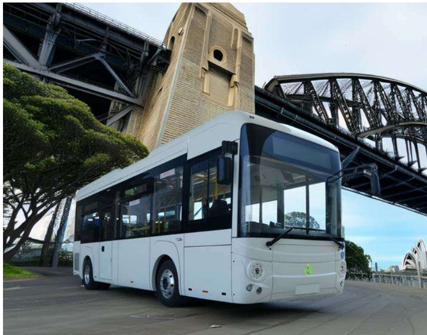
A similar version of the EV80 Electric Bus to be supplied

Sydney, 23 October 2024: Australian clean energy company Pure Hydrogen Corporation Limited (ASX: PH2 or 'Pure Hydrogen') is pleased to announce that it has signed three agreements confirmed distribution agreement and ZE buses with the Vietnam ASEAN Hydrogen Club (VAHC) and BEVs with another domestic party, which collectively will comprise the sale of three hydrogen fuel-cell (HFC) electric minibuses and two HFC electric coaches, and two EV80 electric buses, extensive hydrogen equipment and two single vehicle chargers.