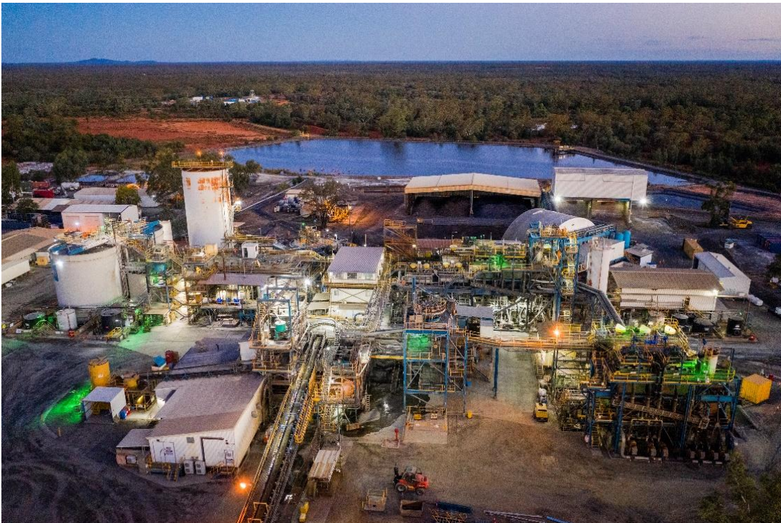
Figure 1: Peak processing plant, showing leach (left), comminution (centre), flotation (right), and filtration (back)

Aurelia wholly owns the Peak (~800ktpa nominal capacity) and Hera (~450ktpa nominal capacity) processing plants, for a total processing capacity in the Cobar region of ~1,250ktpa. Currently, only 550-600ktpa of that capacity is being used, processing Peak Mine ore in the Peak processing plant.