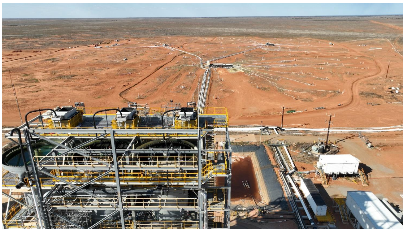
Figure 2: Wellfields 1 and 2 in operation

Columns 4, 5 and 6 will be commissioned in 2025 to enable ramp-up to continue to be in line with Feasibility Study forecasts, to achieve Honeymoon’s nameplate capacity of 2.45Mlb/annum of U_3O_8 .