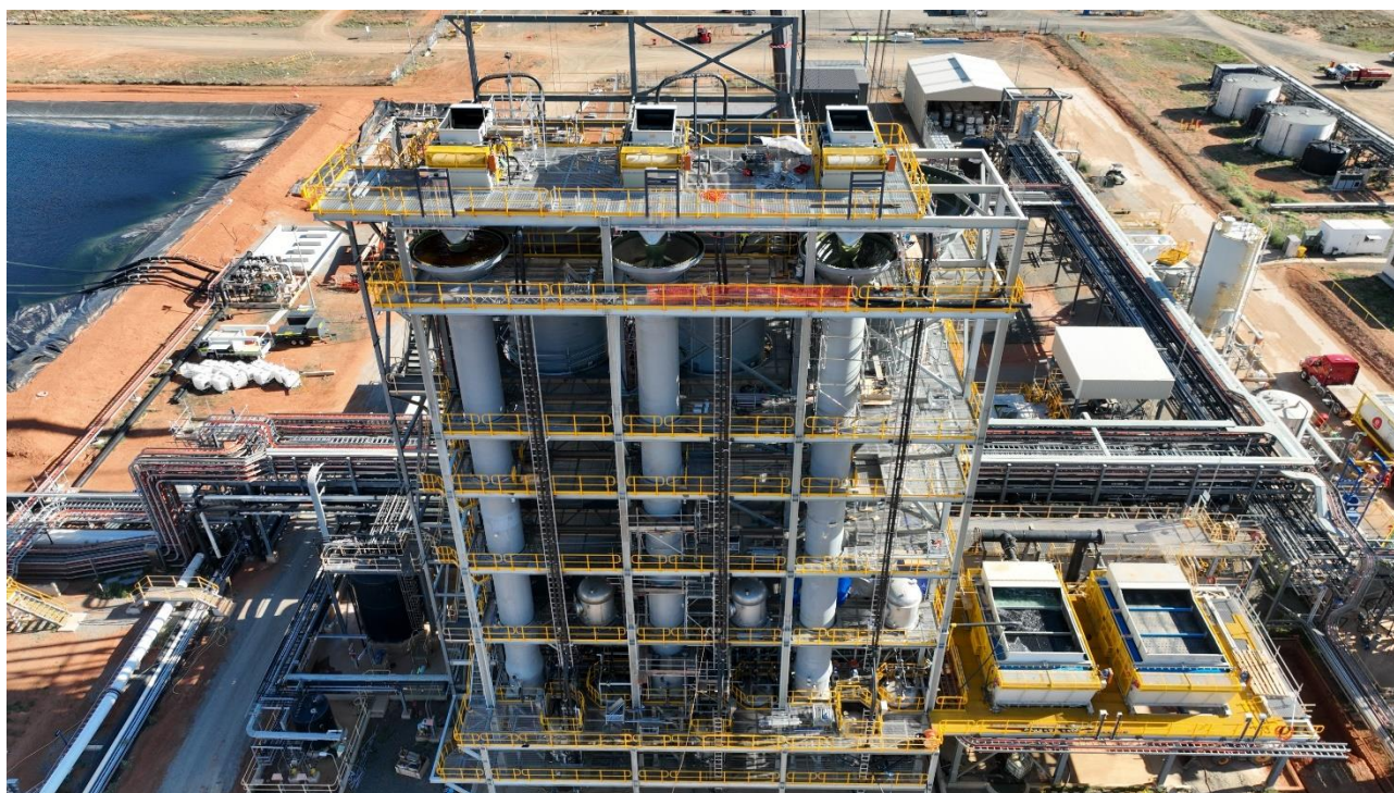
Figure 1: From left to right, NIMCIX columns 1, 2 and 3

NIMCIX 1 is producing at nameplate capacity, NIMCIX 2 has commenced production, and NIMCIX 3 is on track for completion in December 2024.