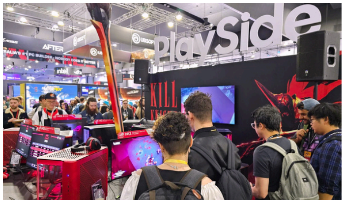
(Clockwise from top left: An activation for Kill Knight in Melbourne's Federation Square, a cosplayer dressed as the 'Knight' playing an arcade machine version of the game, the Kill Knight booth at PAX 2024 in Melbourne, Kill Knight was included in Xbox's 'Indie Selects' showcase at Gamescom in Cologne).