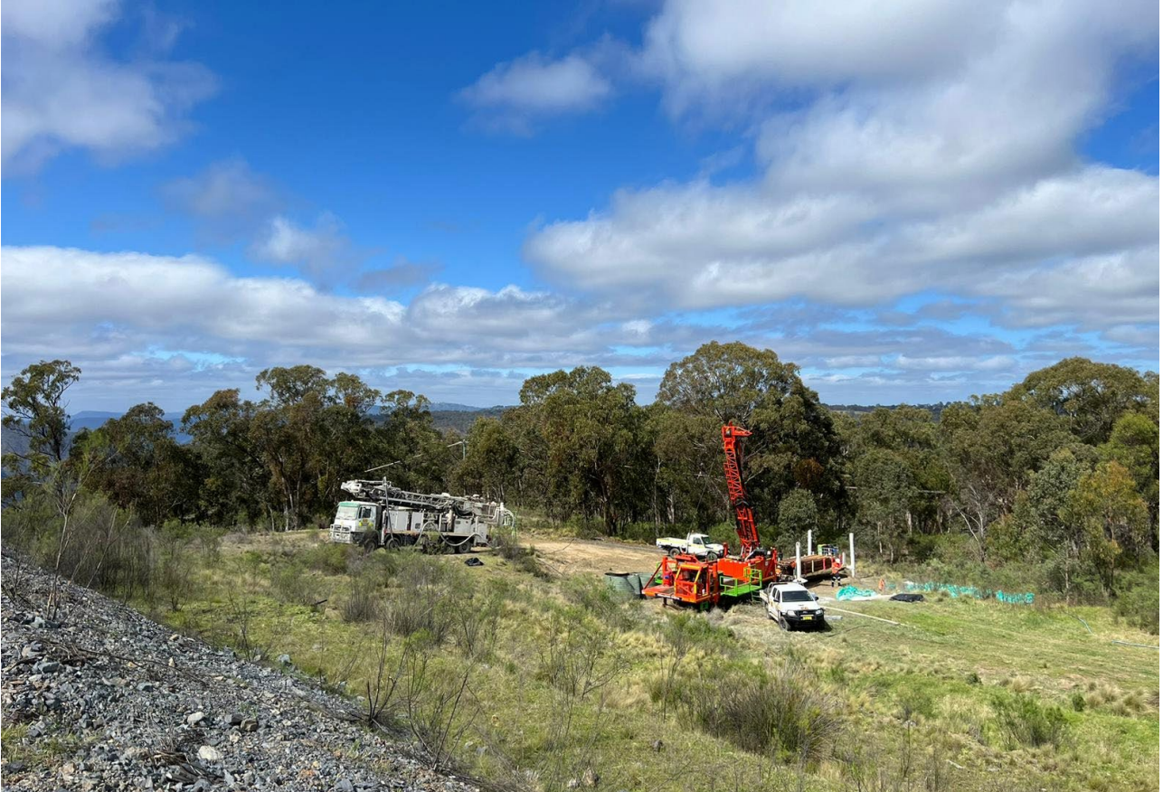
Figure 1 Diamond rig (red) drilling and RC rig (white) moving onto pre-collar No 2 at Garibaldi

The initial drilling programs will target advanced exploration and infill of the Bakers Creek and Garibaldi systems to increase the total resources of the Hillgrove Project.