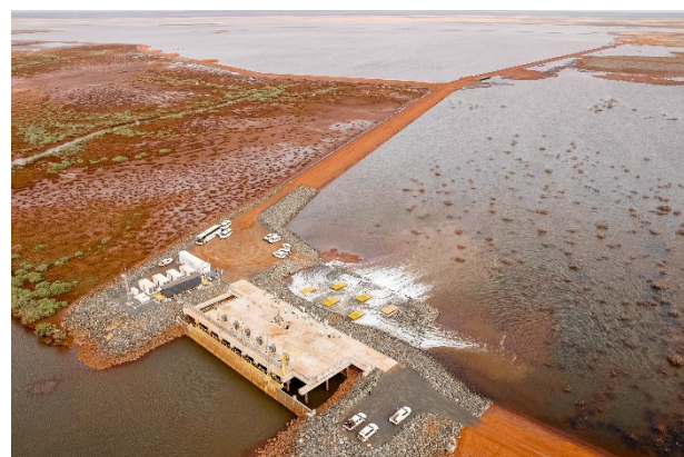
Figure 2: Seawater flowing into Pond 0