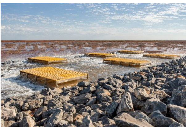
Figure 1: Seawater flowing through the Primary Seawater Intake Station

Lastly, the marine package has reached 73 per cent completion, and the jetty has progressed to its full 2.4km length. Piles from bent J1 to J91 have been driven and headstocks welded. Conveyor infrastructure is progressively being installed.