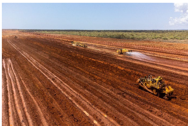
Figure 3: Construction of the crystallisers within the OMP area