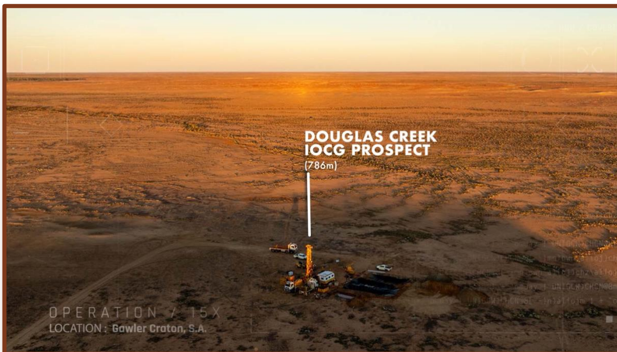
Figure 3. Drilling at the Douglas Creek Prospect (July 2024).

Since 2022, Copper Search has been refining our targeting process to identify and drill test the very best, large-scale targets from an original list of over 40 geophysical anomalies. This process has led the Copper Search team to focus its efforts on the Karari Shear Zone, and the emergence of Douglas Creek IOCG Prospect as a priority target on our list.