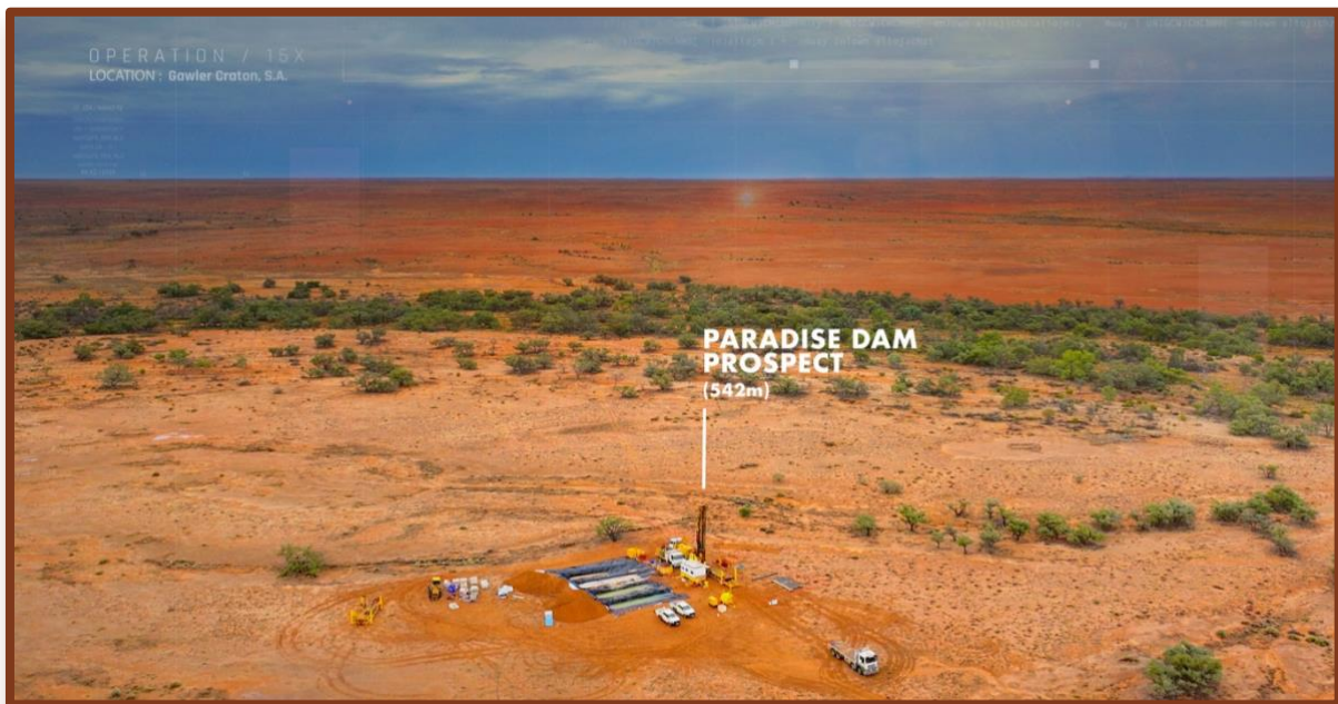
Figure 5. Drilling at the Paradise Dam Prospect (July 2024).

After successfully intersecting IOCG-style mineralisation at the northern end of the Paradise Dam Prospect in late 2023 at drill hole 23PK11, the Copper Search team completed a large-scale 85-line-km Pole-Dipole IP geophysical survey to get a clearer picture of the underlying structures in and around the target zone. In June, the Copper Search Team commenced drilling a 542m hole at the Paradise Dam Prospect.