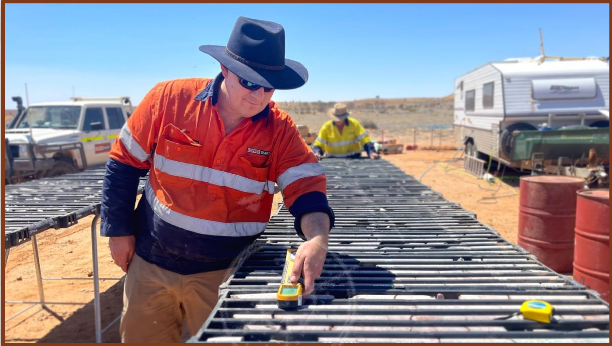
Figure 2. Inspecting core trays at the Paradise Dam Prospect (July 2024).

At Copper Search, our mission goes beyond discovering new copper and gold resources – we aim to find deposits of substantial economic potential. This involves higher technical risk, but is balanced with a high potential reward. Copper Search’s strength is identifying and executing high-reward potential greenfield and remote exploration opportunities.