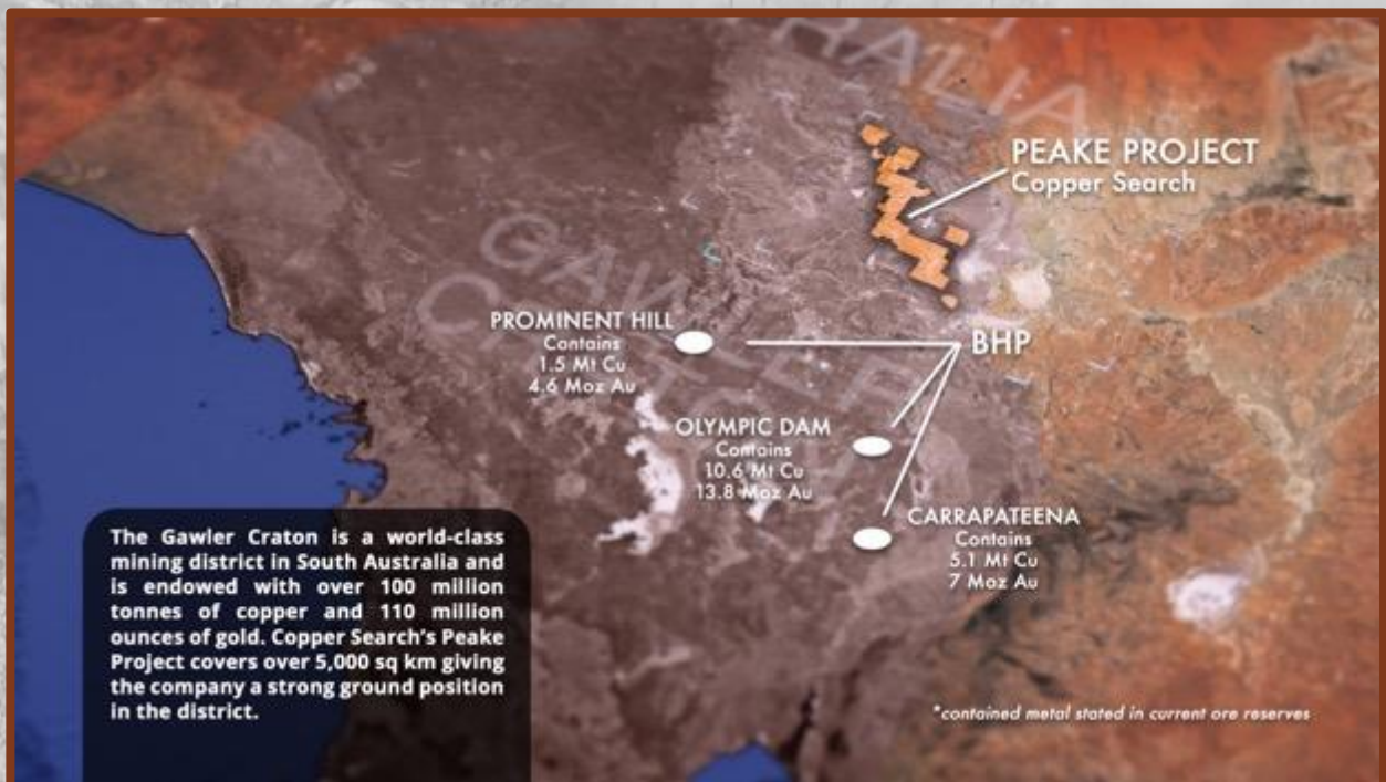
Figure 1. The Peake Project Location.