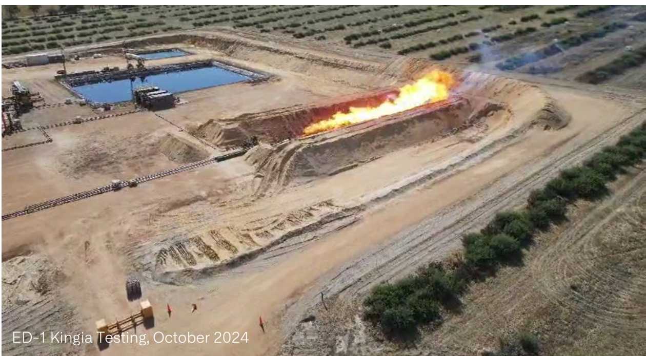
ED-1 Kingia Testing, October 2024

Strike Energy Limited (Strike - ASX: STX) as operator of the EP469/L25 Joint Venture, which includes the West Erregulla gas field, is pleased to announce that it has completed the flow testing program at the Erregulla Deep-1 (ED-1) discovery well in EP469 with excellent results. ED-1, which is the deepest well ever drilled onshore Australia, flow tested the Kingia gas discovery individually and the High Cliff gas discovery via a comingled test.