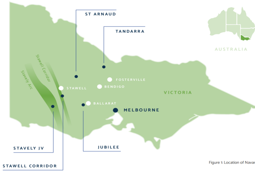
Figure 1: Location of Navarre's Victorian projects.