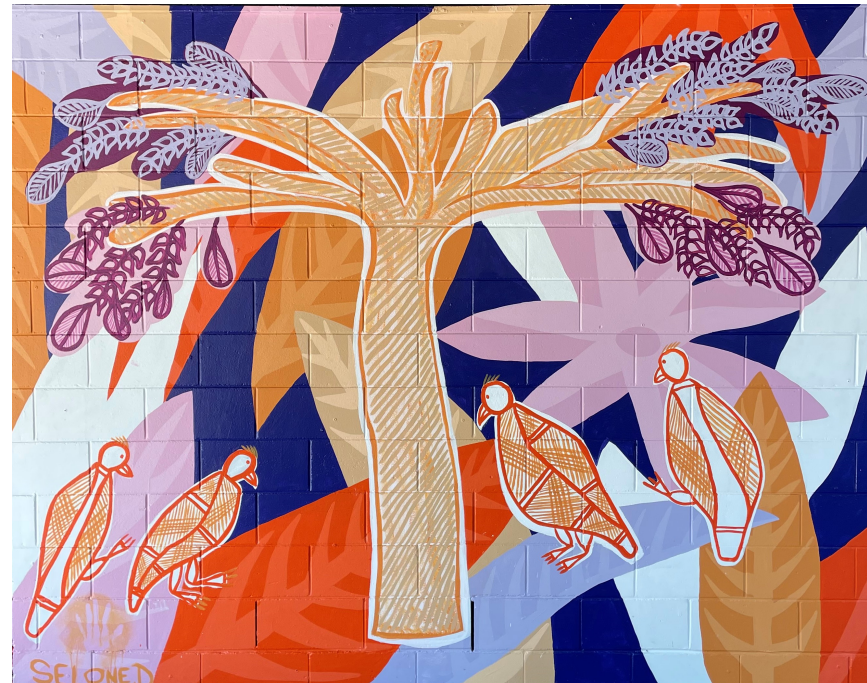
Mural depicting Ngalelek (corella) and karnamarr (black cockatoo) sitting under manmorlak (Kakadu plum tree) sharing manme (food)

We pay our respects to Elders past and present.