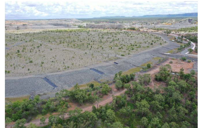
Strong growth of trees on Pit 1