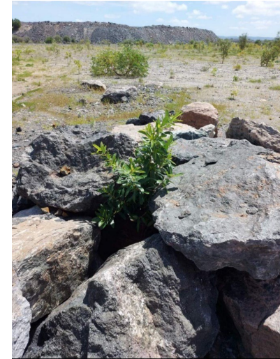
A Rock Fig, not planted by ERA, that has been introduced by another animal and shows evidence of fauna using this rock habitat