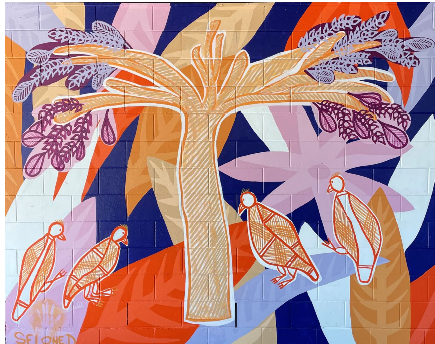
Mural depicting Ngalelek (corella) and karnamarr (black cockatoo) sitting under manmorlak (Kakadu plum tree) sharing manme (food)

We pay our respects to Elders past and present.