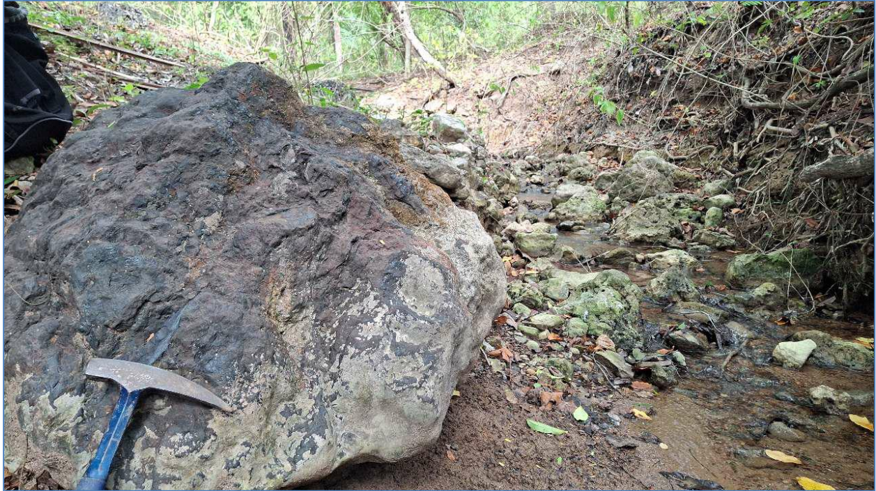
Figure 4: Subcropping chert and supergene material (estimated 85% chert, 15% manganese oxides) near the Sica Prospect This was not submitted for assay however pXRF readings from the manganese oxides were around 21% Mn indicating strong supergene enrichment. Cautionary Statement of pXRF – portable XRF results that are announced in this report are from uncrushed, rock-chip samples and are preliminary only. The use of the Bruker Titan S2 pXRF is an indication only of the order of magnitude of expected results.

The buried and preserved portions of the supergene blanket (an example shown in Figure 4) from which the surficial material has been derived remains the focus of exploration efforts.