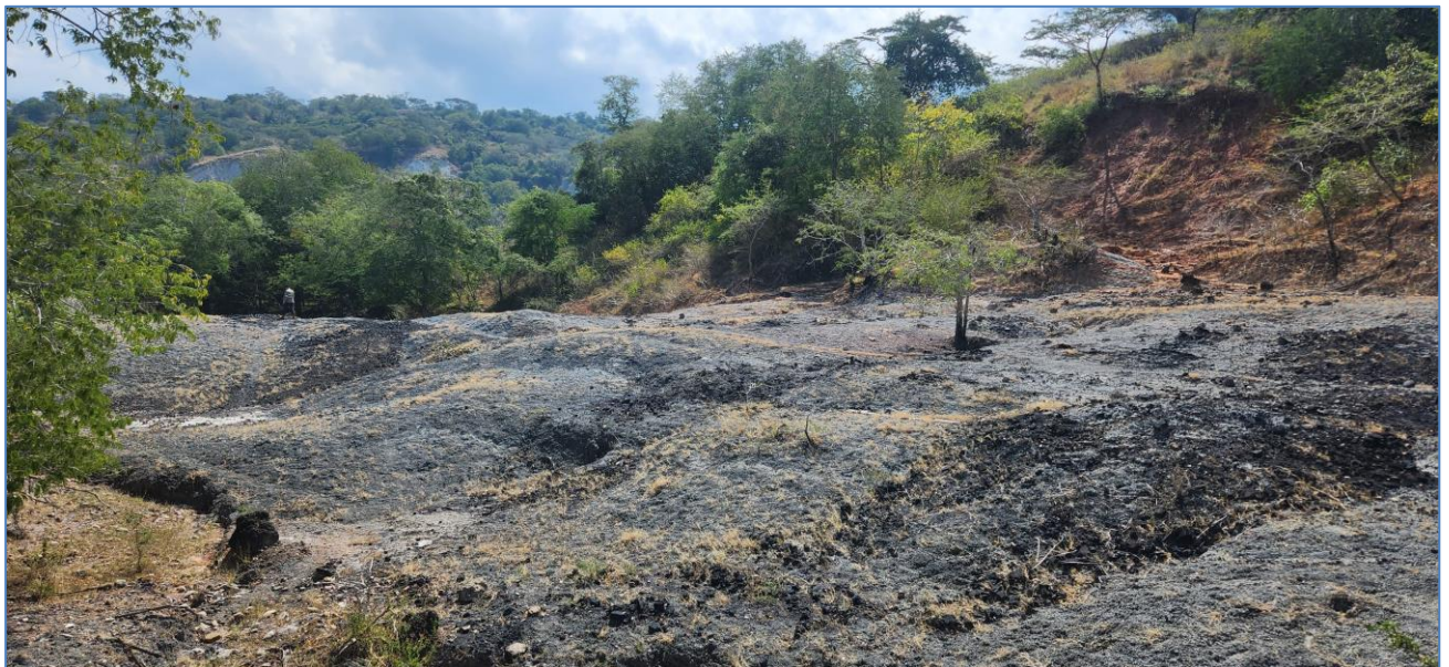
Figure 3: Layer of concentrated high-grade manganese supergene material at the Sica Prospect 1

Mineralisation at Sica and Lalena consists of surface concentrations of manganese-rich cobblestones that are derived from the erosion of the supergene blanket (Figure 3). The concentrated, remnant supergene material can be found over a distance of several hundred metres at both prospects.