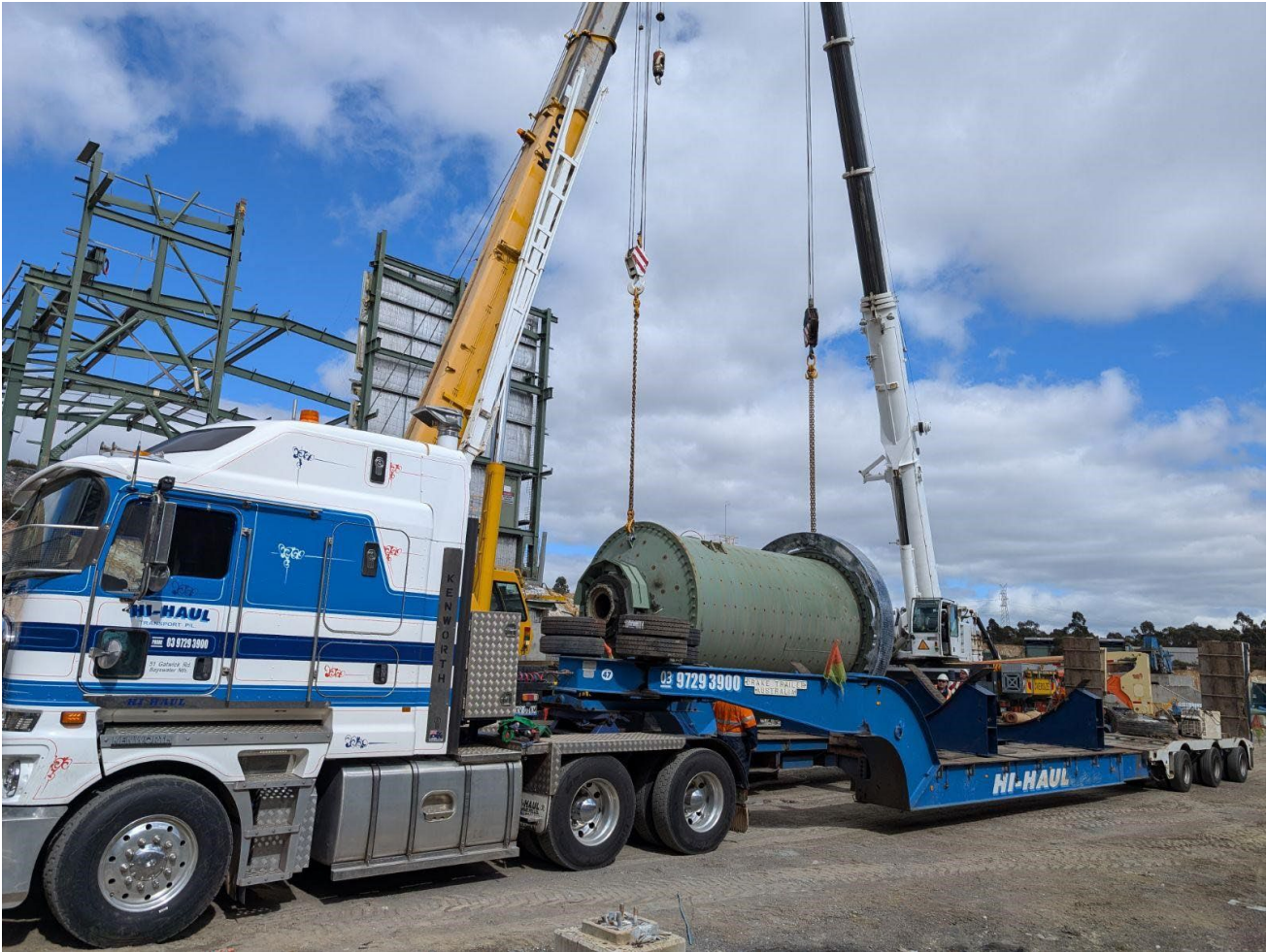
Figure 1: The 750kW ball mill being loaded for transport to the Murchison.