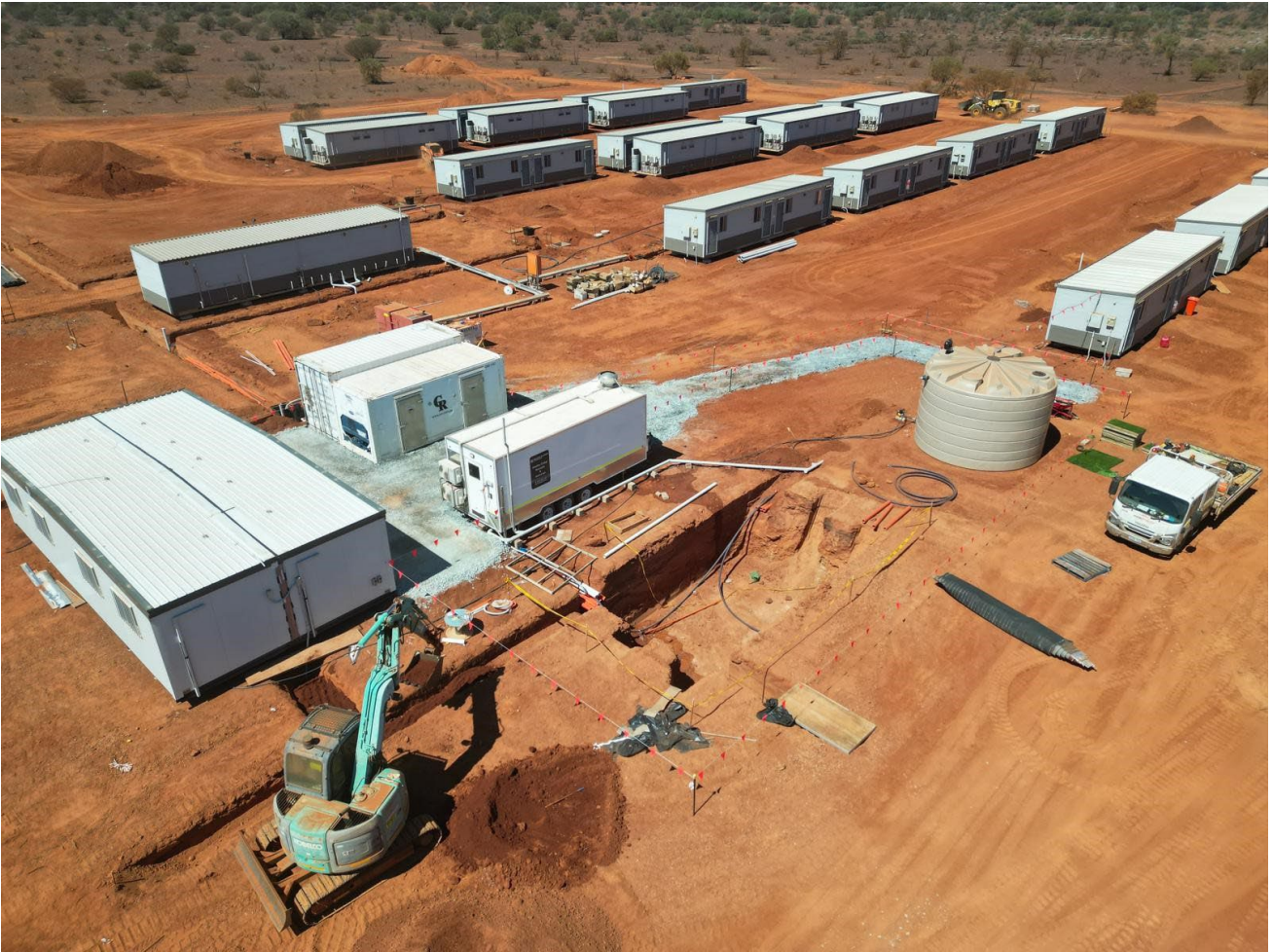
Figure 7: Drone image of progress at the accommodation village.