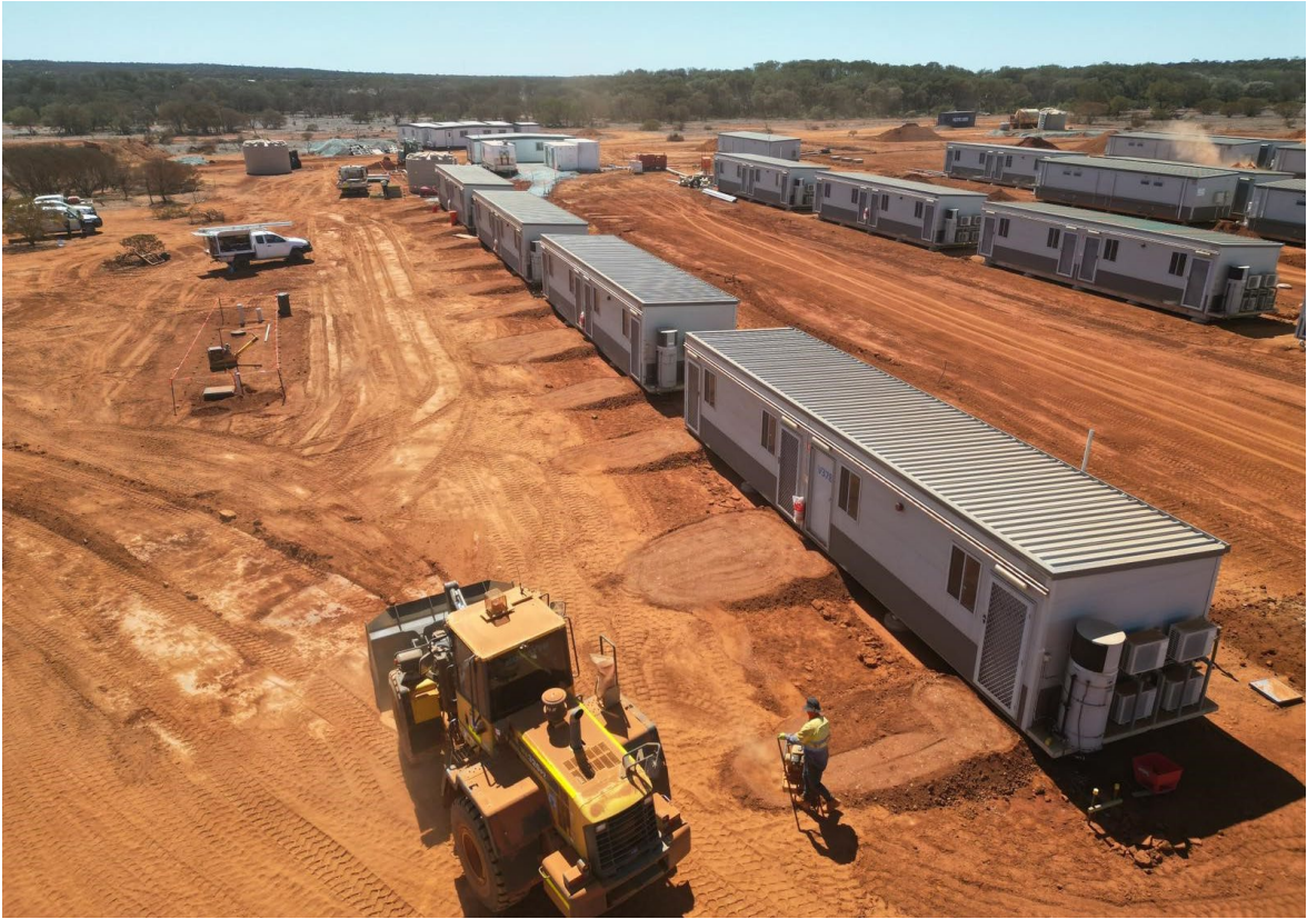
Figure 6: Drone image of progress at the accommodation village.