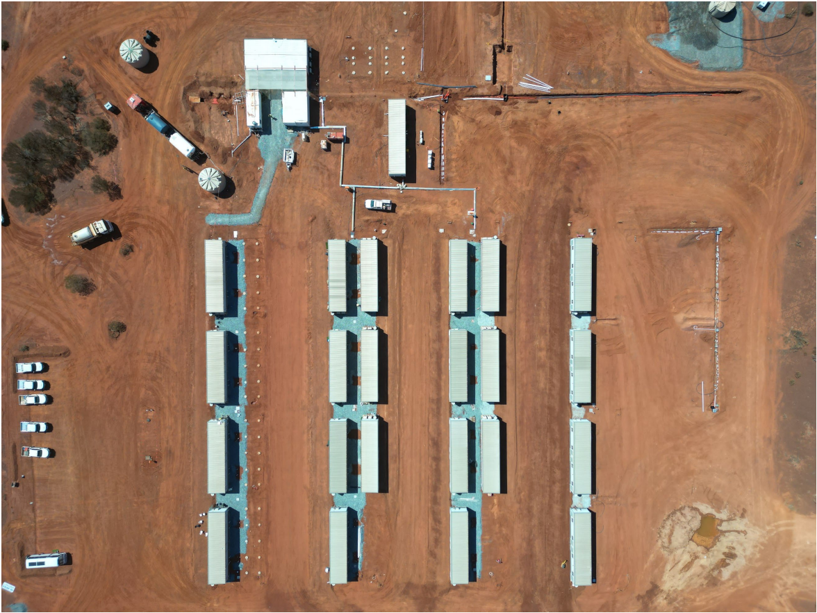
Figure 5: Drone image of the accommodation village. Construction progressing well with 88 rooms installed of a total of 136 rooms.