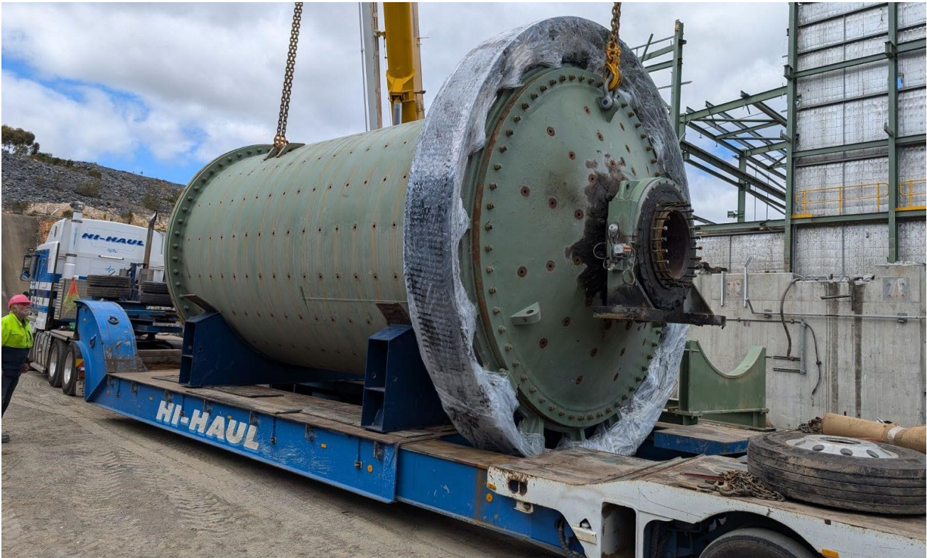
Figure 2: The 750kW ball mill being loaded for transport to the Murchison.