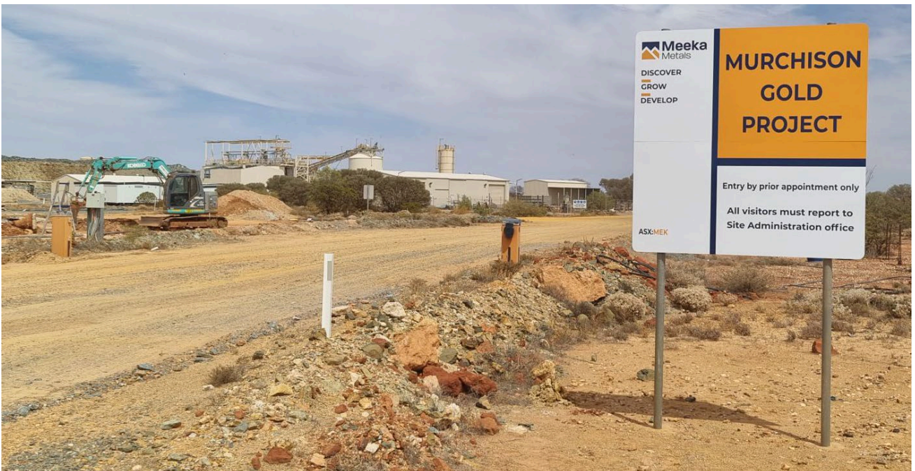
Figure 8: Preparation work for installation of the main administration complex is underway, installation will commence following completion of the accommodation village.