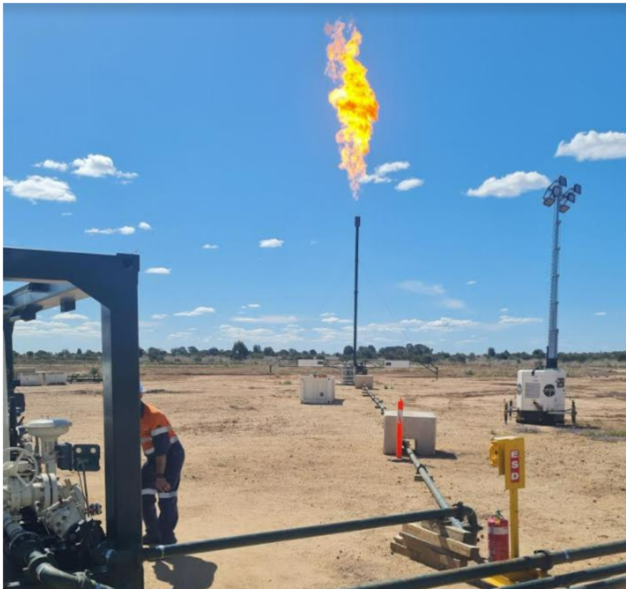
Flare from Daydream 2 prior to well being suspended

This was likely caused by the multiple open and closures of the well during recent operations, or by adverse reactions to fluids introduced into the wellbore. Such issues are common in early stage tight gas plays globally and can be remedied by operational changes to fluid use and well management. Due to the appraisal nature of this well, the extensive multi-phase testing and evaluation undertaken (including for R&D purposes) was required as part of the planning for a future development.