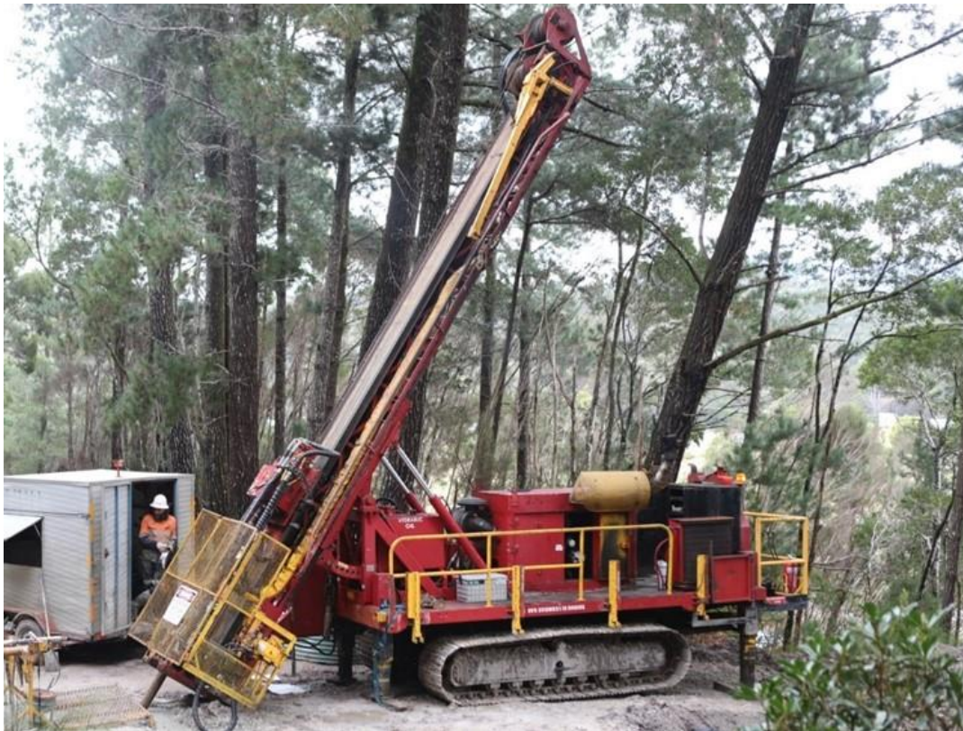
Figure 1 – Diamond Drill Rig at Queen Hill Deposit

"The first results from the drilling program should be available in November and results from ore sorting and metallurgical test work over the December and March quarters."