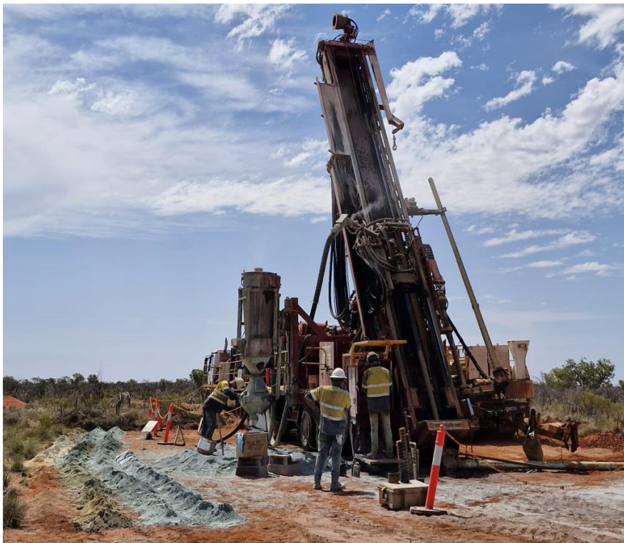
Figure 1: RC Drill Rig at Mount Berghaus

Mantle Minerals Limited ( ASX:MTL ) ("Mantle") ("the Company") is pleased to advise that deep reverse circulation drilling at Roberts Hill (E47/3846) and Mount Berghaus (E45/5899) has commenced.