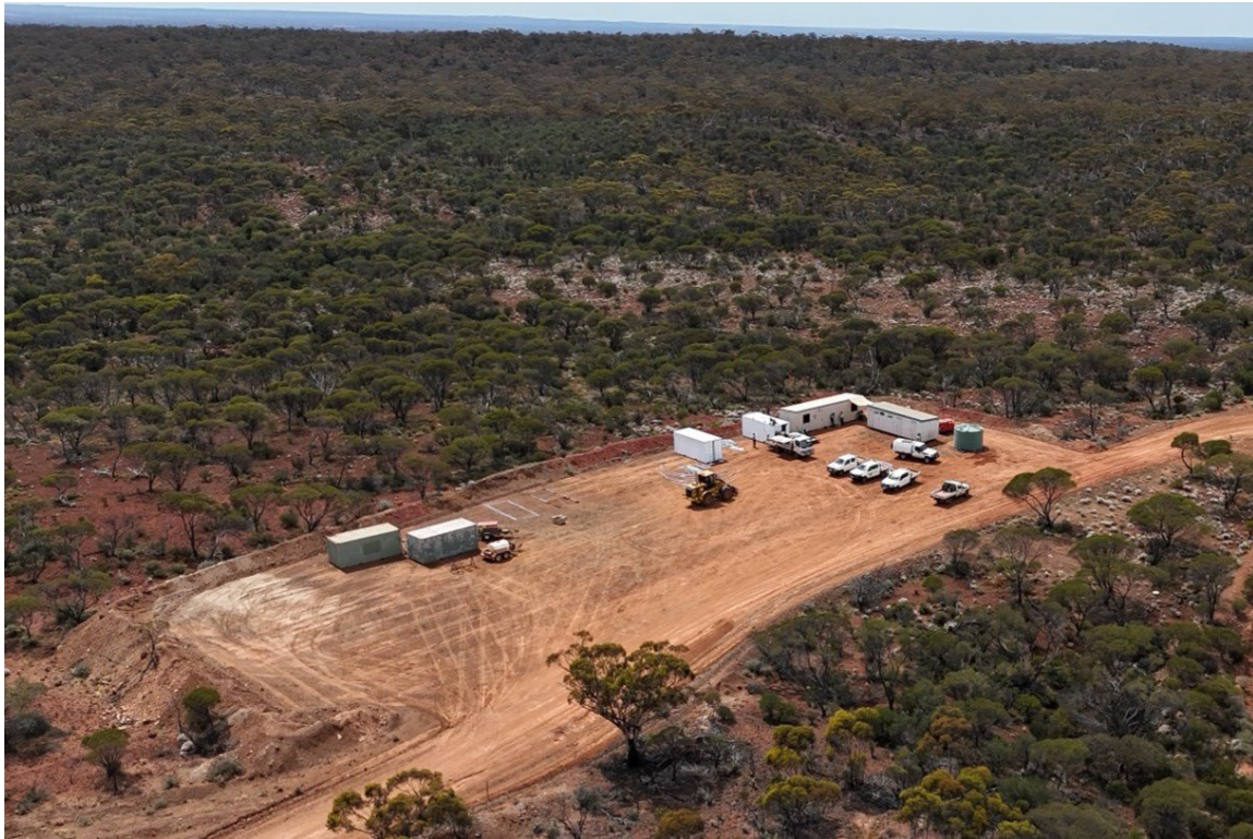
Figure 4: Aerial view of clearing and establishment of offices and workshop area