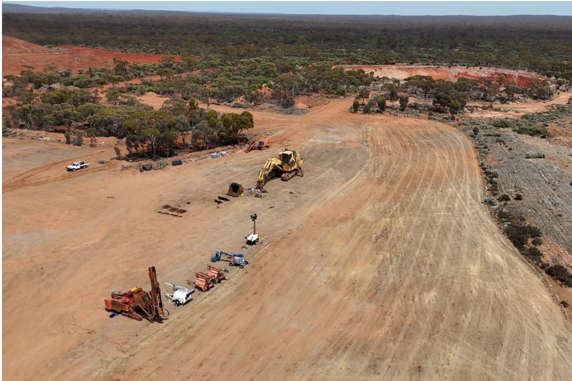
Figure 2: Aerial view of initial clearing and equipment mobilised to Phillips Find