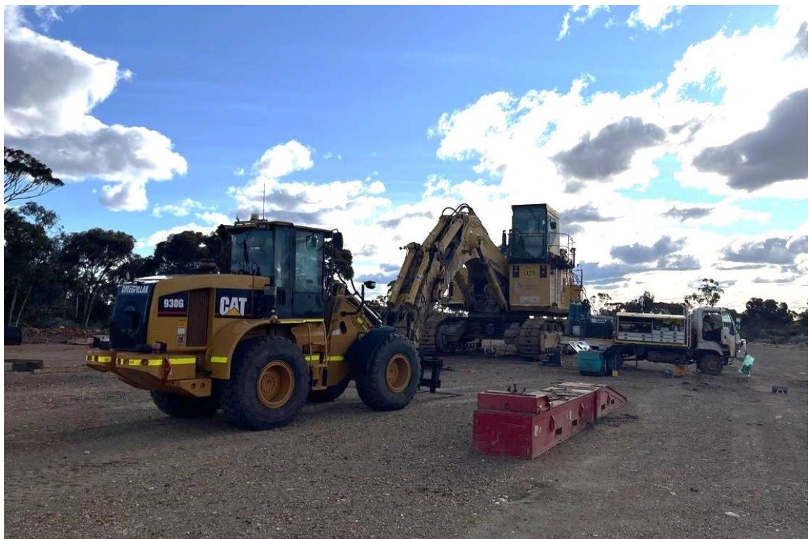
Figure 3: Reassembling the PC2000 excavator on site following transport