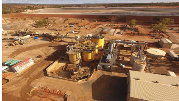
Mt Boppy Gold mine (left) & Wonawinta Silver Mine (right)