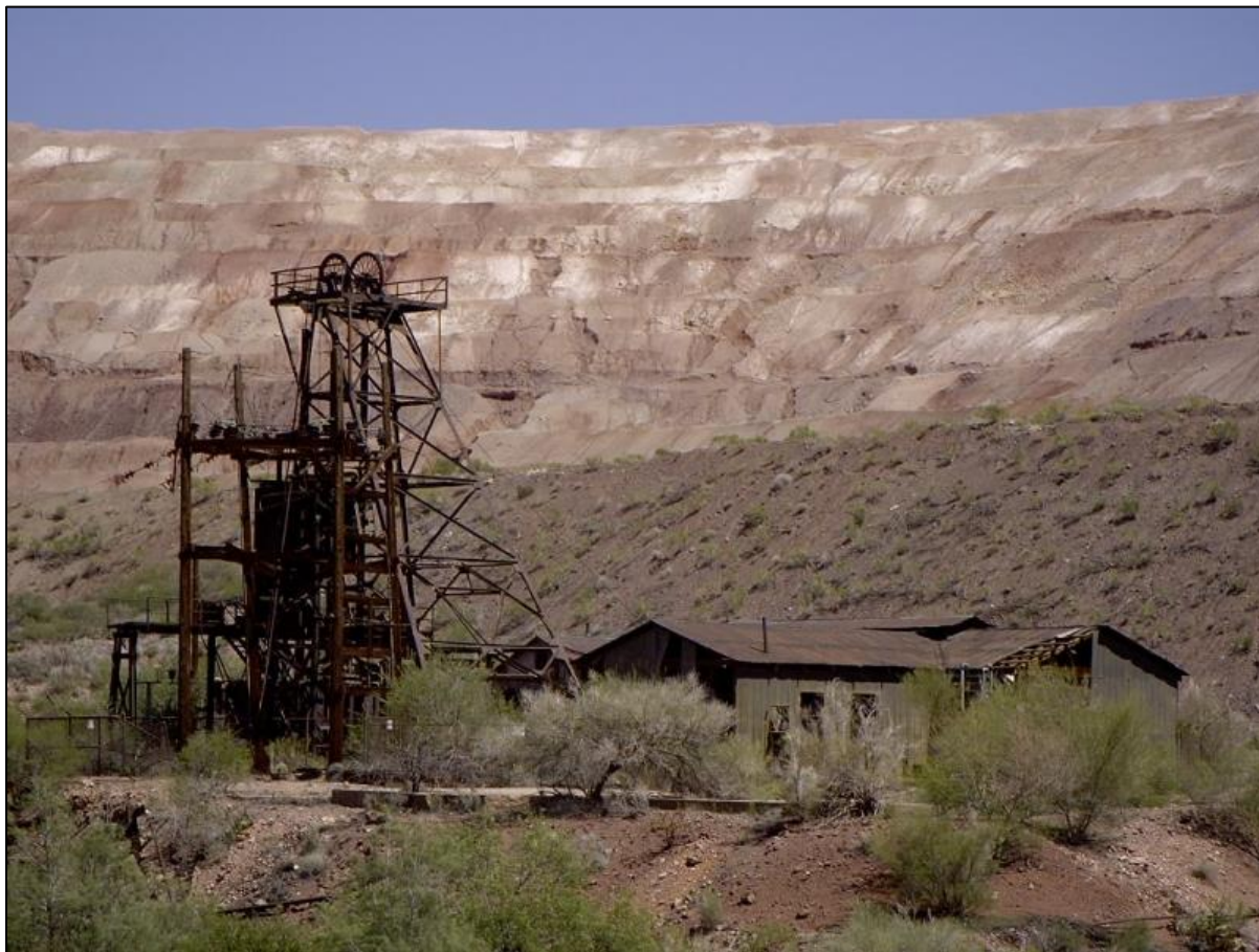
Figure 3: Headframe of the Tiger Mine, San Manuel, Arizona.