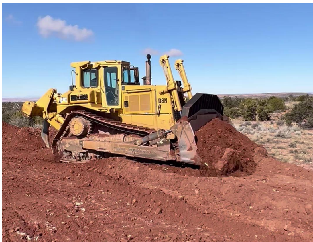
Figure 2: Picture of Commencement of Site Works at Mineral Canyon Site May 2023

Anson had previously been granted approval for its western strategy drilling at Paradox from the Utah Division of Oil, Gas and Mining (UDOGM) (ASX Announcement 25 January 2023), and advised that the requisite Reclamation Bond had been paid (ASX announcement 22 March 2023). Site works commenced at the Mineral Canyon Fed 1-3 well in the Q2 2023, (ASX Announcement May 4, 2023).