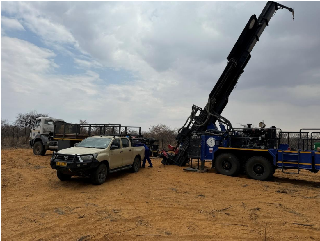
Figure 1: Drill rig setting up on the first hole at Fiesta.