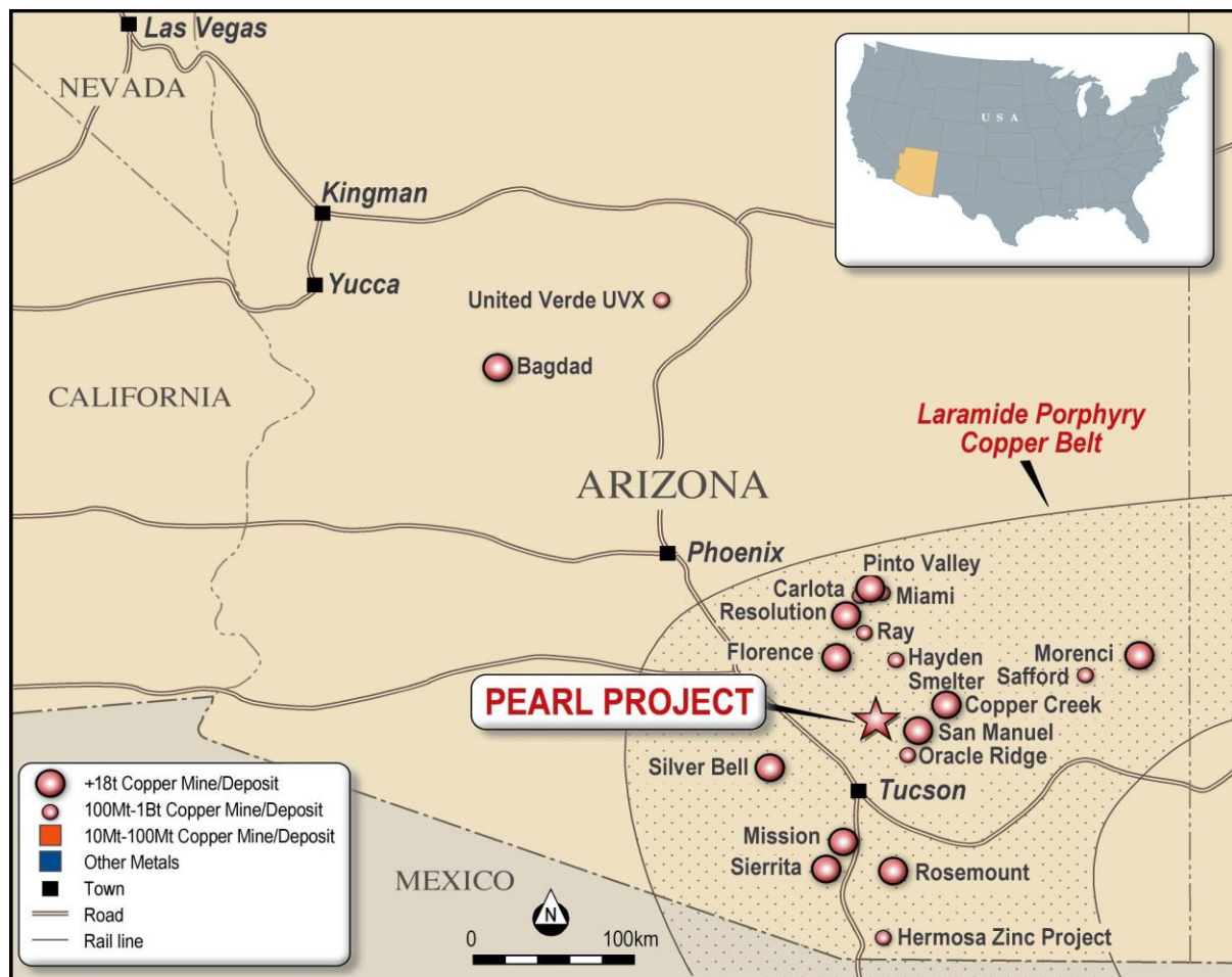
Figure 5: Major resource projects in Arizona, USA.

The Project has been subject to minimal modern exploration surveys, yet is situated immediately north of BHP’s San Manuel-Kalamazoo Mine, one of the largest deposits in the Laramide Porphyry Copper Province.