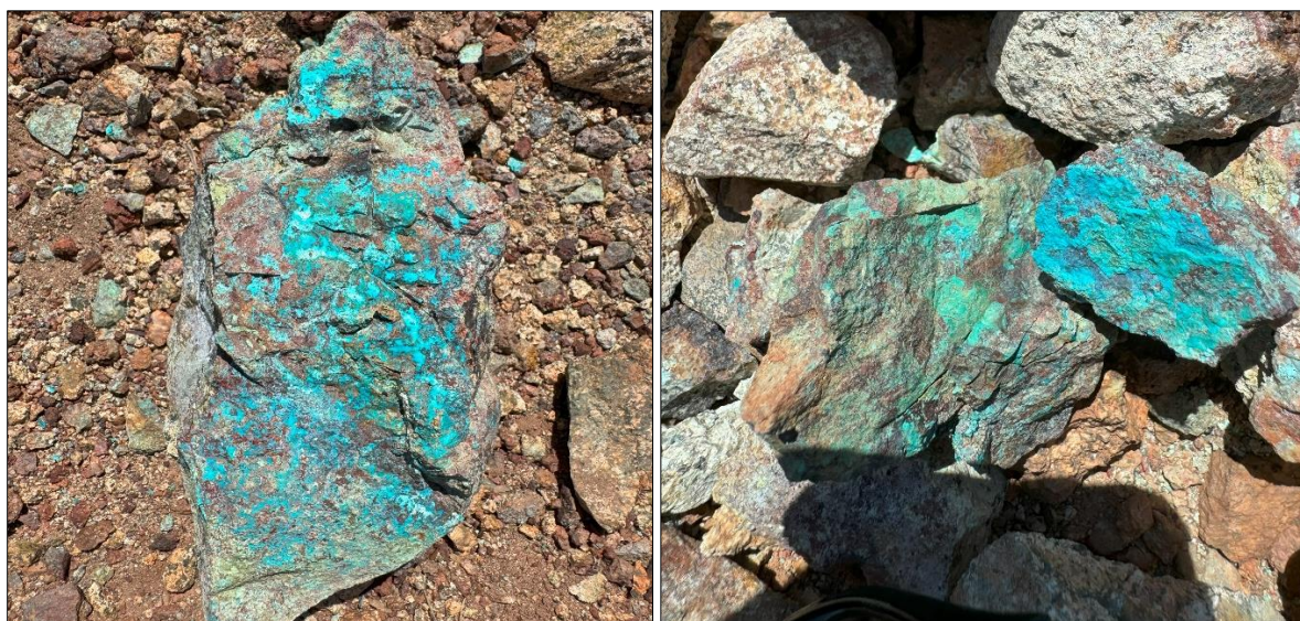
Figure 1: Odyssey Prospect hydrated copper carbonate and phyllosilicate mineralisation

The Odyssey prospect has never been drilled.