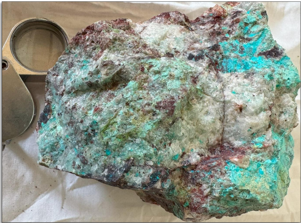
Figure 3: 24PRL002. 930 g/t Ag, 2.37% Cu. Quartz vein with iron oxides, copper carbonate within granodiorite host rock.

The mineralised hydrothermal veins at the Odyssey Prospect are within a larger, north-west trending extensional fault structure. This structure can be traced over many kilometres, with several parallel structures apparent from photogrammetry interpretation (Figure 2).