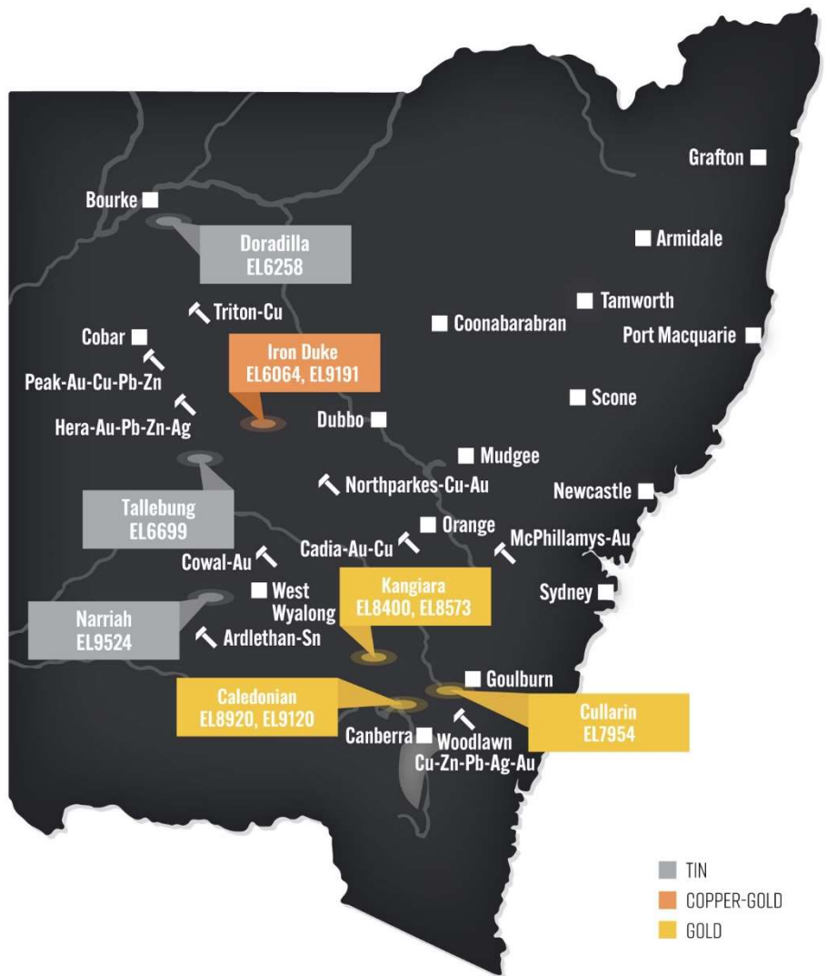
Figure 2: SKY Tenement Location Map

Highlight, ‘McPhillamys-style’ gold results from previous exploration include 36m @ 1.2 g/t Au from 0m to EOH in drillhole LM2 and 81m @ 0.87g/t Au in a costean on EL8920 at the Caledonian Project.