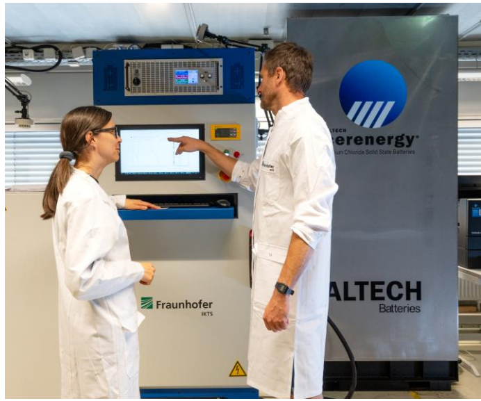
Photo: Prototype 60 kWh battery being assembled and tested at Fraunhofer IKTS laboratory