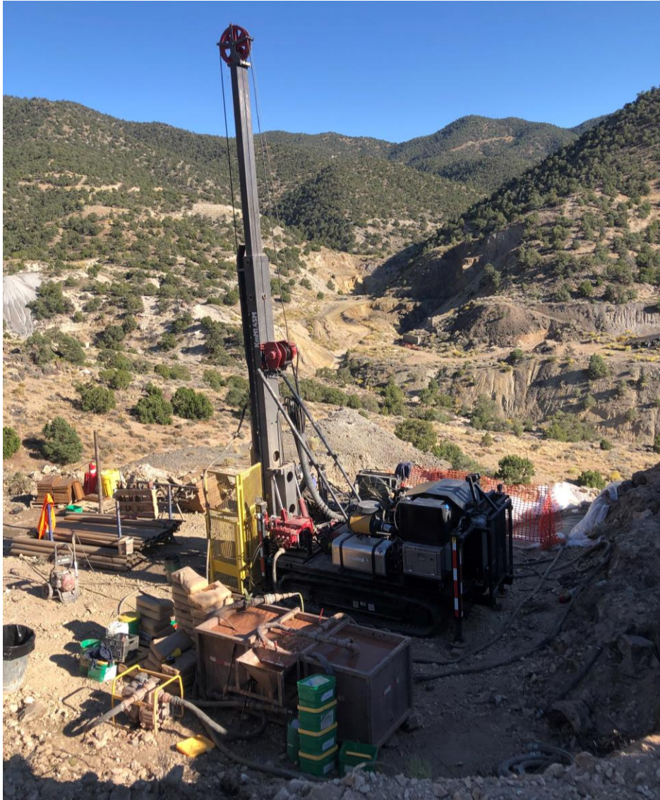
Figure 4: NY2024-DDH2 looking southeast with the historical Cactus copper-gold mine workings in the background

disseminated in the tourmaline matrix. Visible pyrite and chalcopyrite sulphide mineralisation occur from around 37m downhole and extend to the end of the hole at 121.9m. The hole intersected a 1.5m void at a depth of 90m which is likely to be an opening from the old mining at New Years. pXRF readings along the length of the hole are in progress.