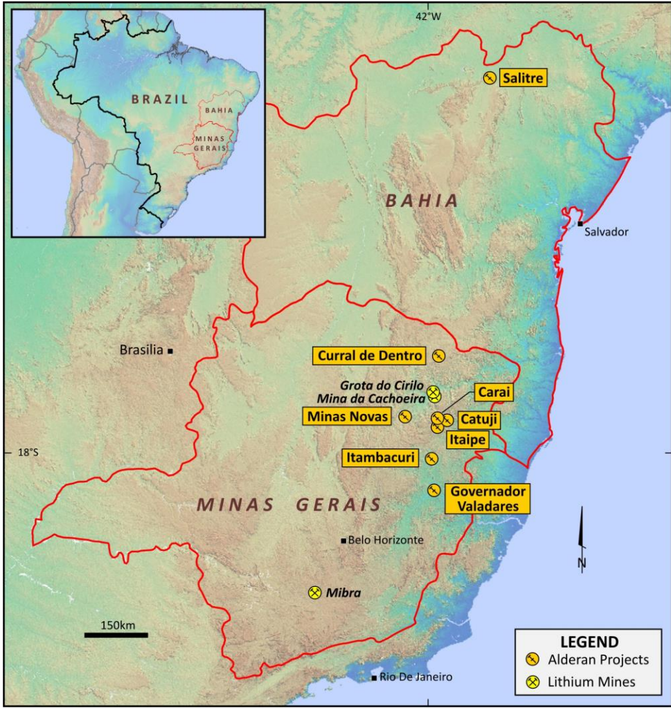
Figure 6: Alderan Resources project locations in Minas Gerais and Bahia, Brazil.