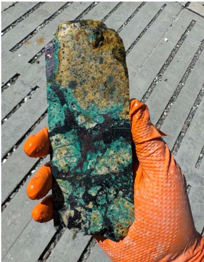
Figure 2: NY2024-DDH2 drill core at 14.0-14.2m downhole. The pXRF copper grade over 3 readings averages 23.2%.

“The 30m copper mineralised intersection in Alderan’s hole NY2024-DDH2 from 10m downhole appears to broadly correlate and extend the historical hole NY-6 intersection which was 13.7m @ 2.32% Cu within 19.8m @ 1.67% Cu from 22.9m downhole. Although pXRF assays are not yet available, based on visuals hole NY2024-DDH3 appears to have intersected copper mineralisation to a depth of around 99m from surface – much deeper than historical hole NY-2.