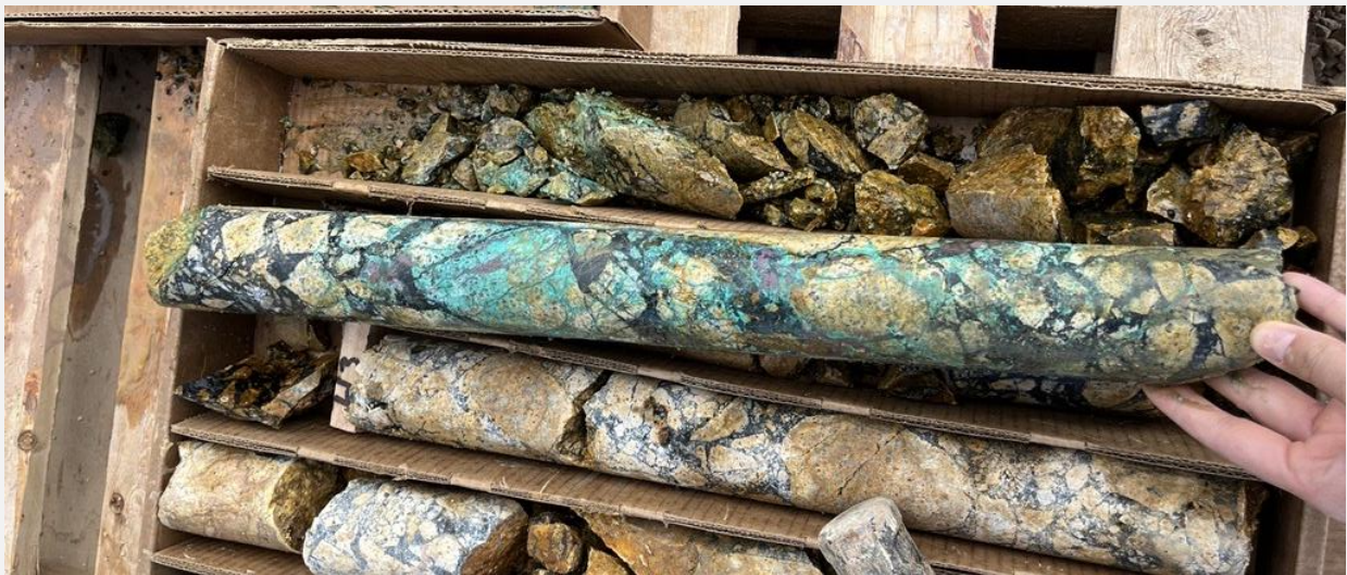
Figure 1: High grade copper mineralisation in tourmaline breccia which contains pXRF grades up to 45.5% copper within the interval 14-16m down hole NY2024-DDH2

Cautionary Note: Visual estimates and pXRF readings described in this release and detailed in Appendix 3 should not be considered a proxy or substitute for laboratory analyses. Laboratory assays are required to determine representative grades and mineralisation intervals reported from geological logging and pXRF readings. Visual estimates also potentially provide no information regarding impurities or deleterious physical properties relevant to valuations. Drill core from this