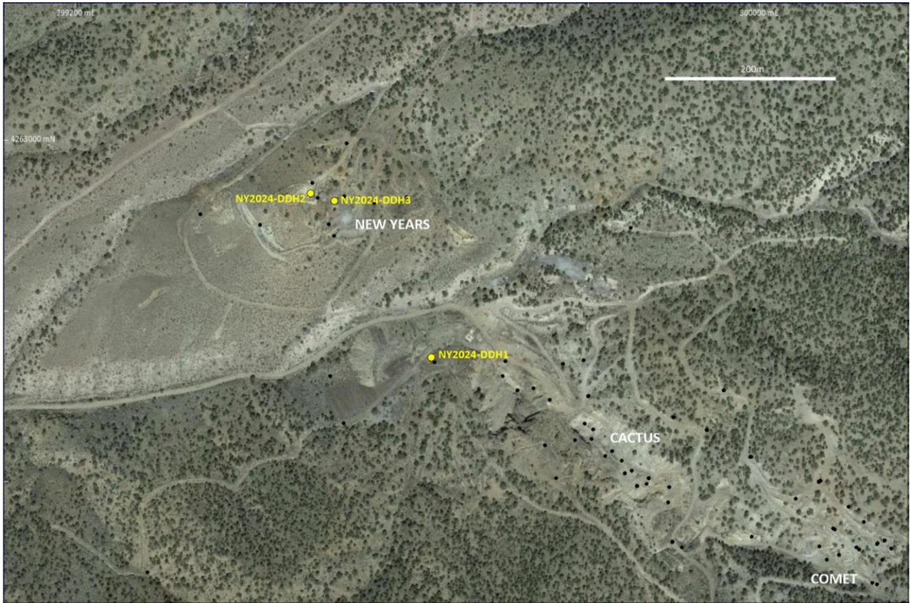
Figure 3: Alderan's drill holes (yellow) and historical holes (white) at New Years plus the location of the Cactus and Comet historical copper-gold mines.

2.32% Cu within 19.8m @ 1.67% Cu from 22.9m downhole. The third hole, NYM-1 which was drilled in 2002 and intersected 10.7m @ 1.60% Cu and 4.6m @ 1.3% Cu within 42.7m @ 0.80% Cu from surface, had up to four different locations in old reports with the most likely site believed to be the co-ordinates on the original drill log. This placed the hole midway between the historical Cactus copper-gold mine and the New Years prospect.