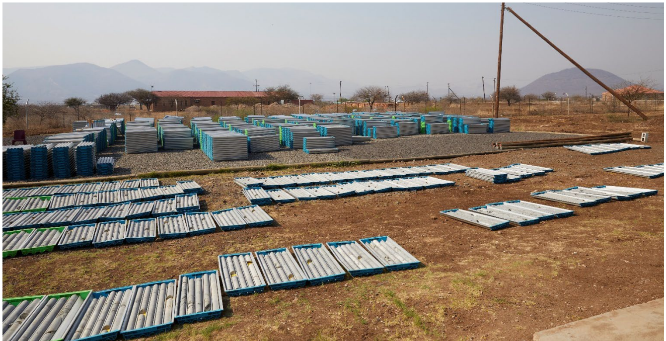
Figure 1: Core yard at the Operational Offices

The drilling campaign has been highly successful leading to an improved geological understanding of the project and increased confidence in the Mineral Resource. This success has resulted in the declaration of Measured and Indicated Mineral Resources with the conversion of Exploration Targets in the remaining project area into an Inferred Mineral Resource.