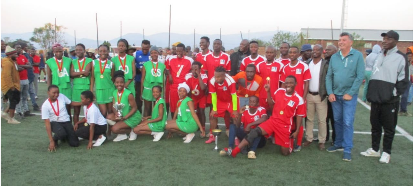
Figure 3: Annual Soccer and Netball Tournament a resounding success

Southern Palladium entrenches principles of environmental stewardship throughout its business. Exploration activities are undertaken in a manner that takes acute cognisance of the social and biophysical environments. Measures are implemented to mitigate negative impacts and alternatives that promote environmental stewardship are preferred. Moreover, assessments are made during the prospecting operations to mitigate impacts as they occur.