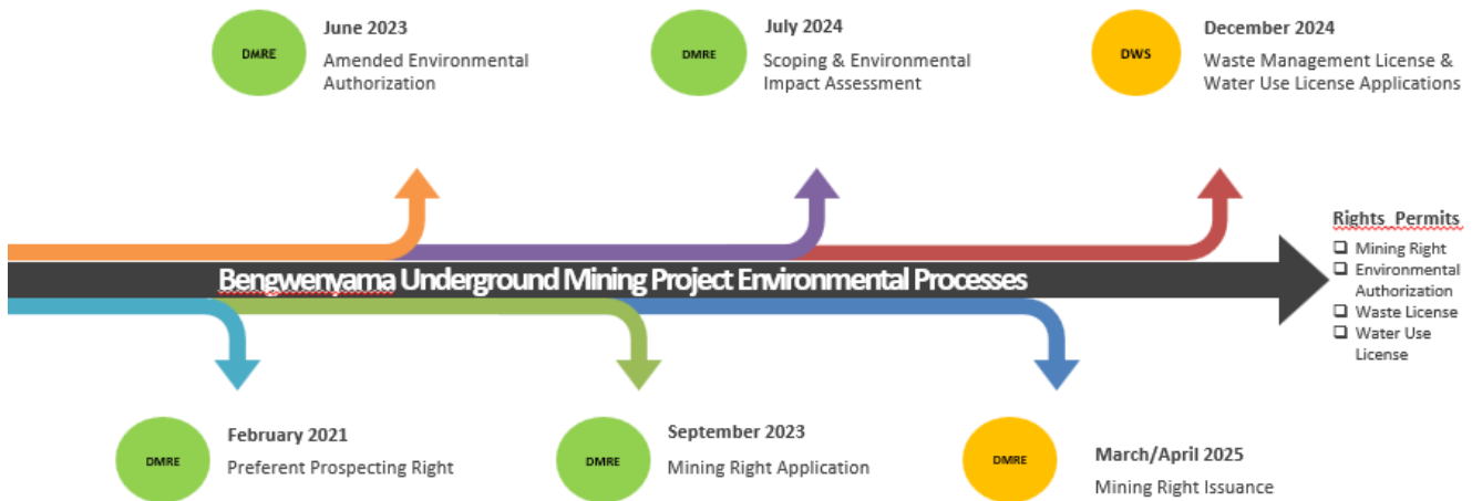
Figure 4: Mining Right Application Timelines

Additional permit applications are in progress, including a Waste Management Licence (“WML”) application and a Water Use Licence (“WUL”) application, which will be submitted for water uses associated with the Bengwenyama Project.