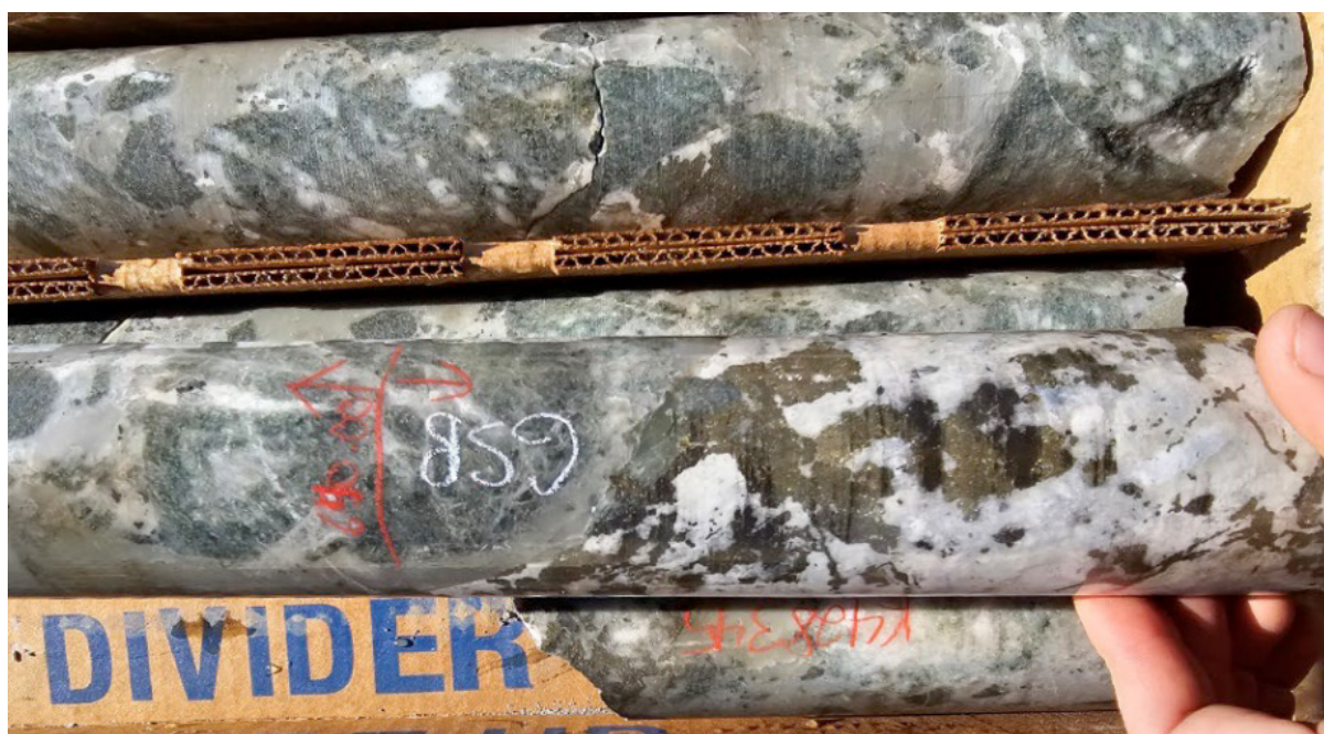
Figure 1: Sulphides in core in CM23-14