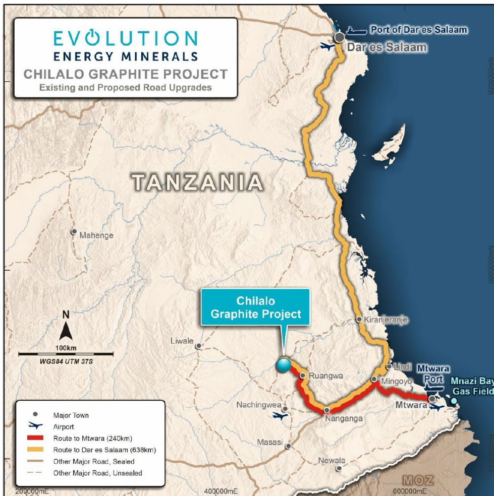
Figure 3: Reduced transport logistics via Mtwara port

The Mtwara Port is envisaged to divert exports away from the Dar es Salaam port which is more congested. This may result in potential concessions being offered to exporters utilising Mtwara. Evolution is working with logistics companies and the port to obtain accurate cost estimates for road transport, storage and shipping. Evolution is increasingly confident in its ability to utilise the Mtwara Port for shipping Chilalo concentrate. With a shorter trucking route and lower shipping costs compared to Dar es Salaam, significant reductions in shipping and road transport expenses are anticipated.