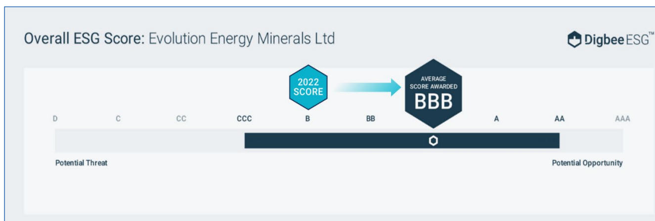
Figure 4 – Overall ESG Rating