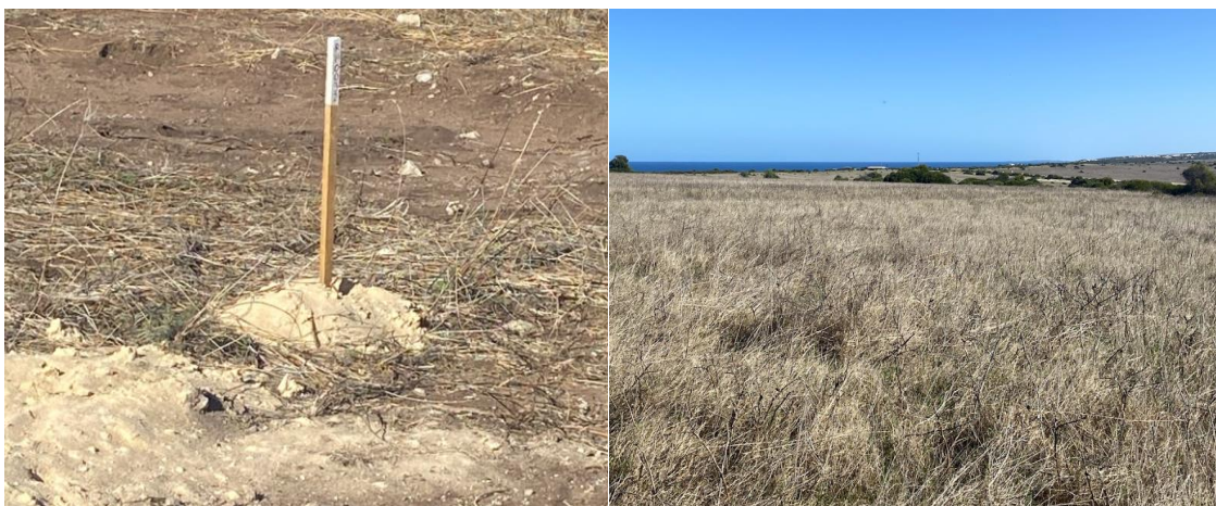
Figure 2: Red Hill Project

Heavy has also been undertaking work to design resource evaluation programs and gain land access to its regional tenements to determine the prospectivity of these tenements.