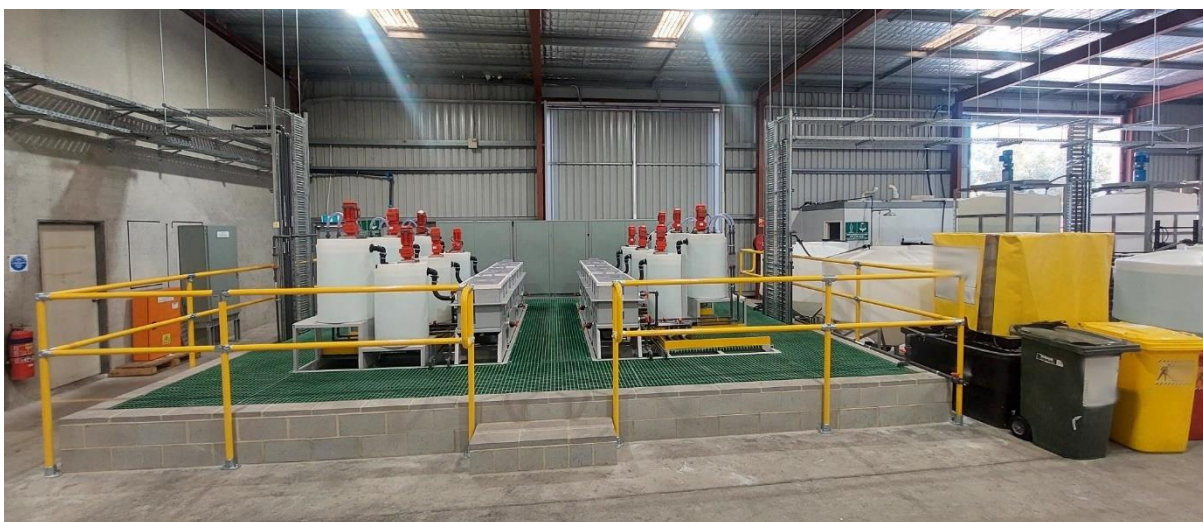
Figure 1 – ChemX HiPurA ® Solvent Extraction (SX) module completed, pending energisation infrastructure installation

The above initiatives deliver improved layers of safety with regard to solvent (SX area) management and provide inventory hold points within the process where purity may be quantitatively tested/verified against expected elemental purity before processing further. These cost saving measures negate unnecessary processing of sub-standard interim process batches, build towards key commercial plant design considerations, and unlock advanced process optimisation capabilities.