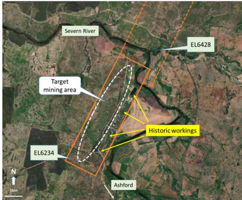
Map – Target Mining Area