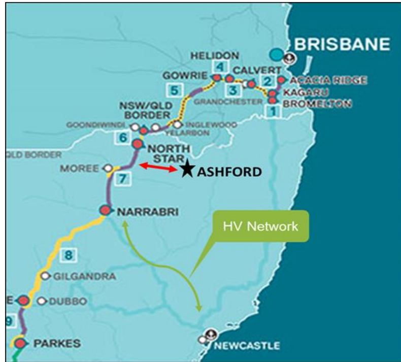
Map - Inland Rail Project

The Ashford Coking Coal Project comprises two (2) exploration tenements, EL6234 and EL6428. Both areas comprise geological features that provide potential opportunities for relatively shallow open cut coal mining.