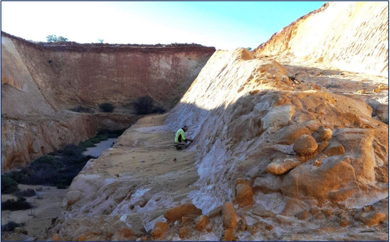
Open Pit mapping at the Mindoolah Mining Centre, Mindoolah Gold Project.