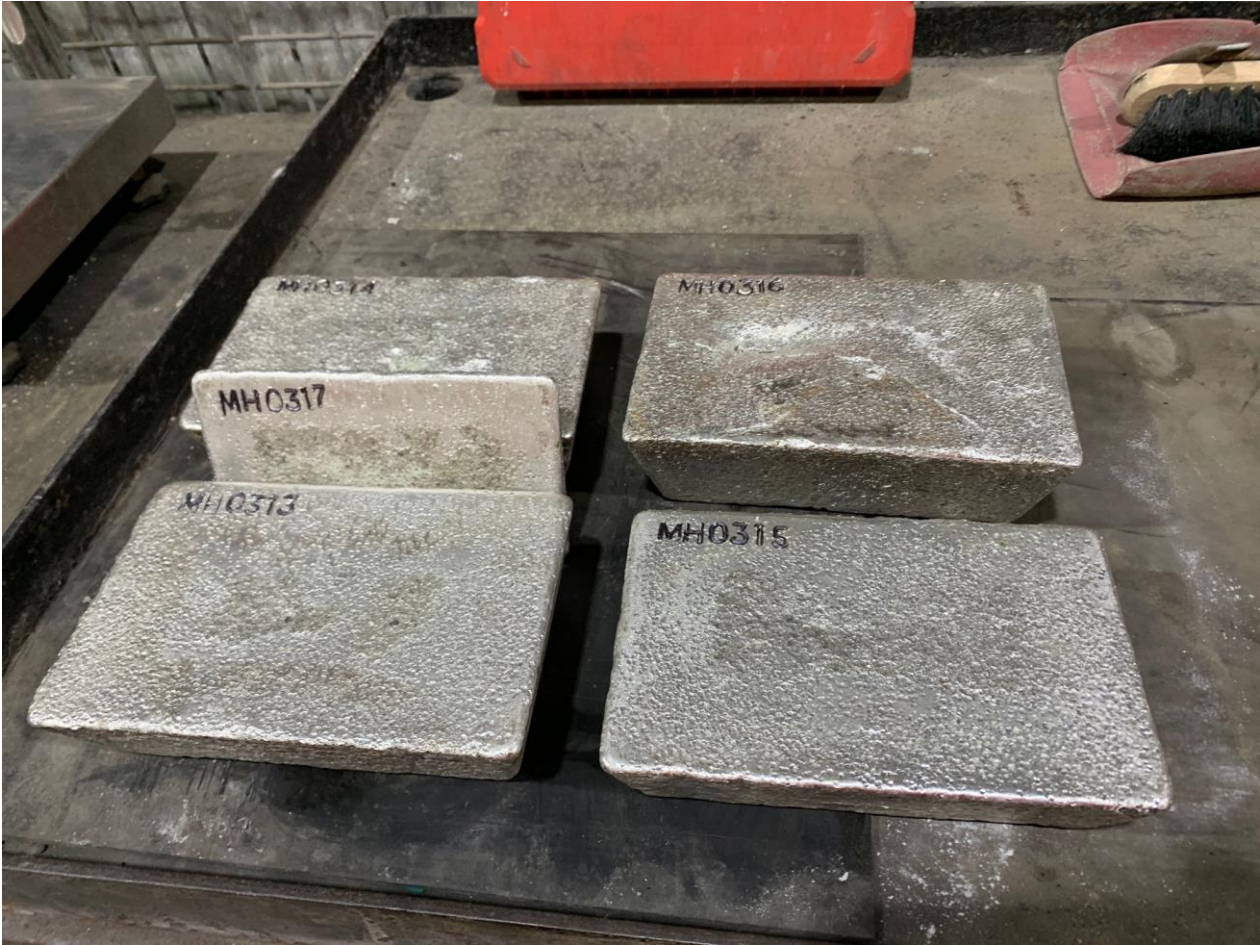
Figure 2: This week's 56kg sale of gold/silver dore from Mineral Hill, estimated at 20% gold and 78% silver.