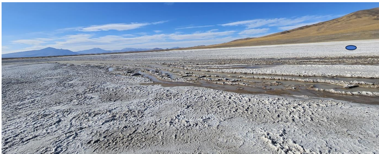
Figure 2. Location of well 4 blue dot (top right) showing salt on surface

Phillip Thomas, Executive Chairman commented "These cores contain sand and quartz gravel and reflect the high porosity geology in the Paso basin. One of the critical factors in lithium production is to have high porosity and ideally sands with high pore values and high connectivity. Examination of the sections in the field demonstrates these qualities. Clay content is very low and in some cores not present."