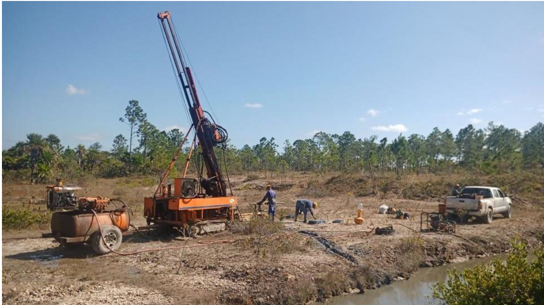
Drilling - El Pilar