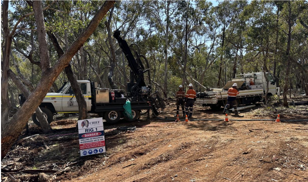
Figure 1 – RC Drill Rig on site over the Kempfield NW Zone