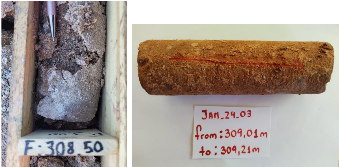
Figure 1. Core that was sent for porosity testing showing sands at 308.50m depth. Right hand side picture is core sent for testing from well JAM24-03 recently completed showing sandy matrix with gravel.

All three wells have been lined with 4 inch PVC tubing ready for NMR (nuclear magnetic resonance) porosity and permeability logging that will be undertaken when all four wells are completed.