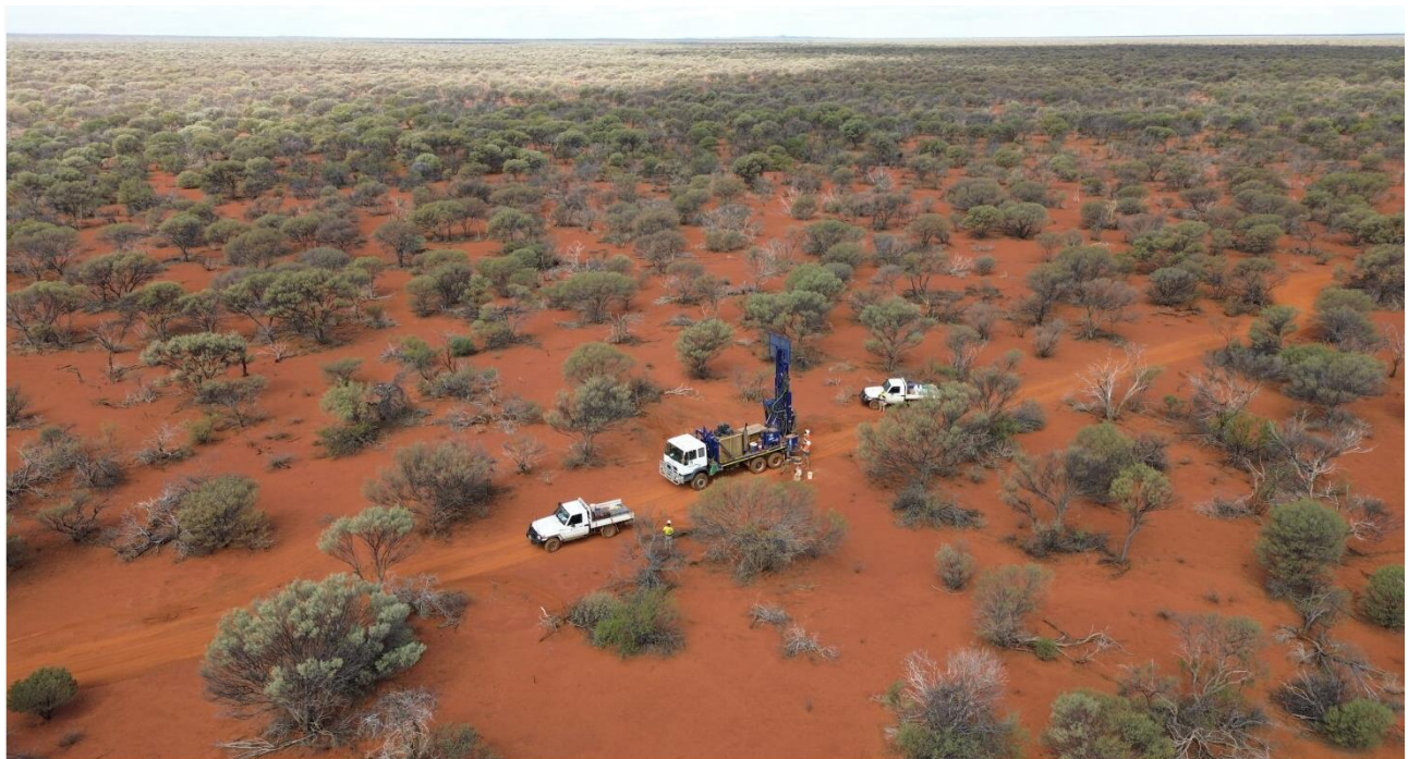
Figure 3: Reconnaissance aircore drilling in typical shallow transported terrain.

With an extensive belt-scale footprint in WA's Eastern Goldfields, the Company continues to offer strong leverage to gold exploration success. The robust cash position of $17.5 million at 30 June 2024 provides Solstice with excellent flexibility to expand its asset base beyond its current Projects, and the Company continues to review a number of compelling business development opportunities.