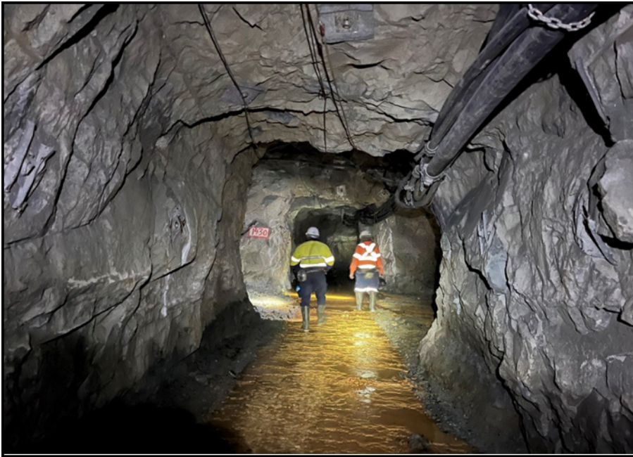
Figure 4: On-site workers in Amalgamated Adit (640 Level), main access for the Reward gold mine