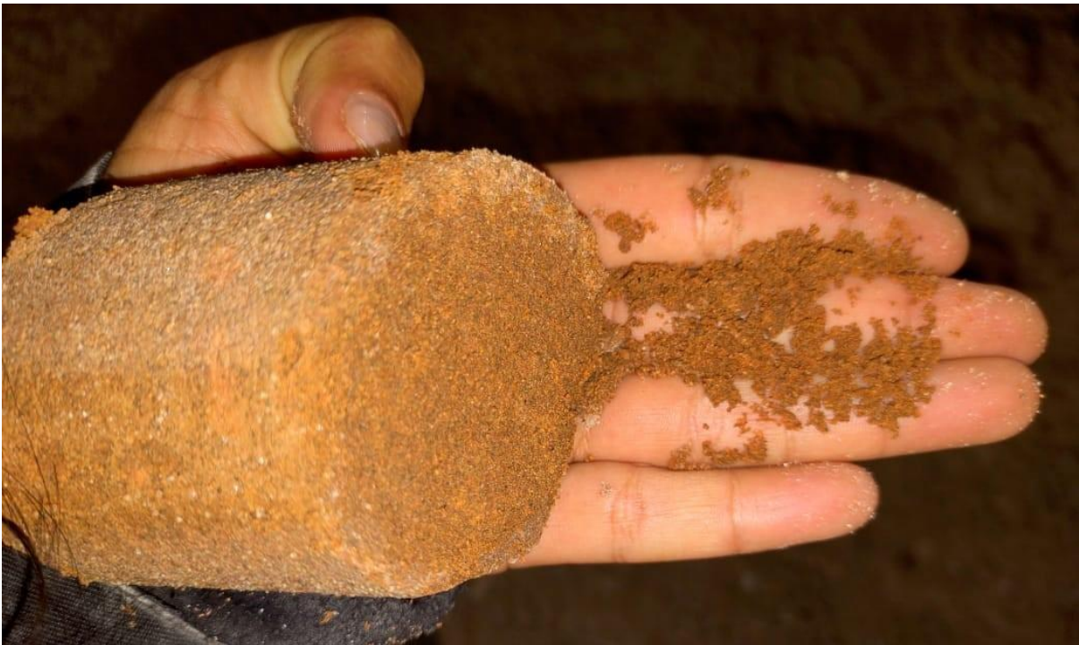
Figure 3: Porous sands at 152m depth in top section of aquifer