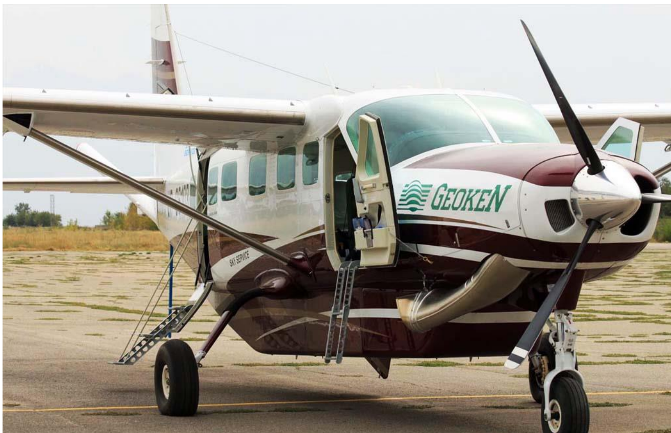
Figure 1 – Aero-Magnetic Survey Completed at Bainazar this week.