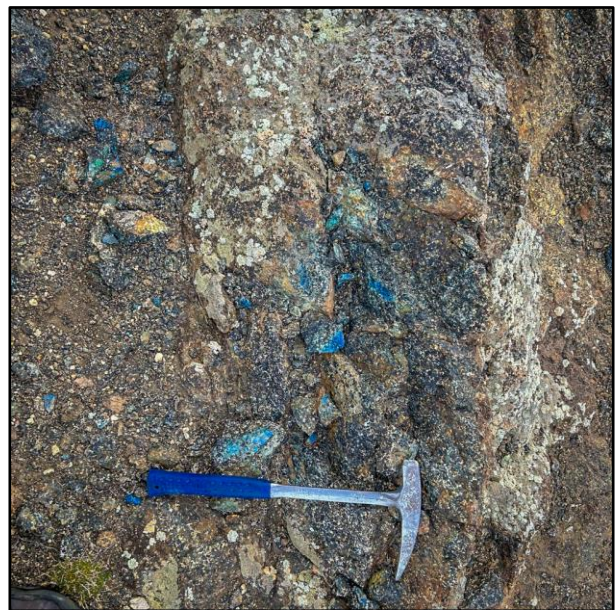
Figures 4 and 5: Outcropping Copper Oxides and Disseminated Sulphides.