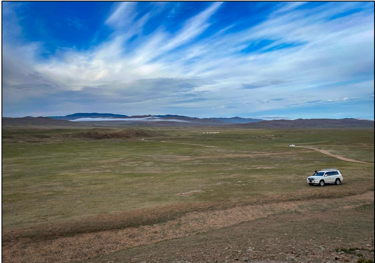
Figure 3: Sant Tolgoi terrain with exploration camp in background