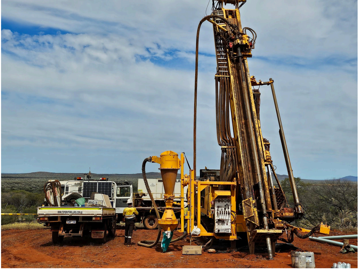
Figure 01: Reverse Circulation Drilling commencing on WARDH160 at the Remorse Target