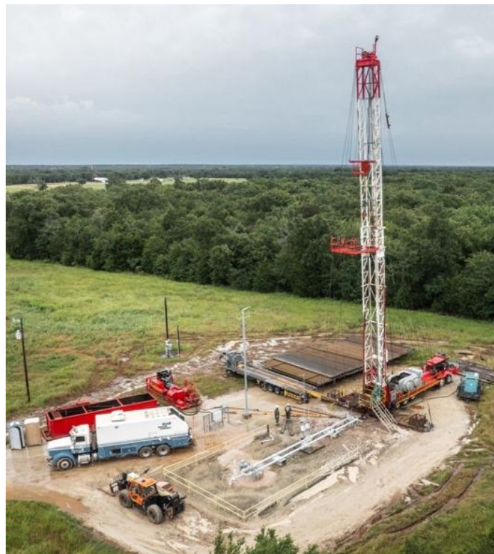
A Production Services Inc Rig servicing other groups well in Arkansas