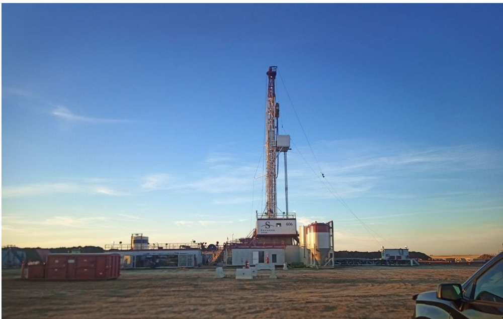
Figure 1: Drilling Well #3 on Pad #1. Well #1 and Well #2 can be seen in the foreground of the drilling rig

Well #3 is being drilled as an exploration well. As noted in the company's Pre-Feasibility Study, the company requires production wells, disposal wells and brackish water source wells for its commercial operations. Having three wells drilled on Pad #1 means the company will have all of the necessary well infrastructure to support the company going into production on Pad #1 in 2025.