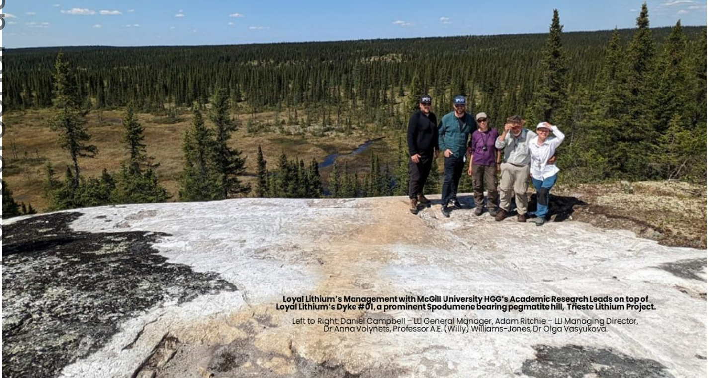
Loyal Lithium's Management with McGill University HGG's Academic Research Leads on top of Loyal Lithium's Dyke #01, a prominent Spodumene bearing pegmatite hill, Trieste Lithium Project.