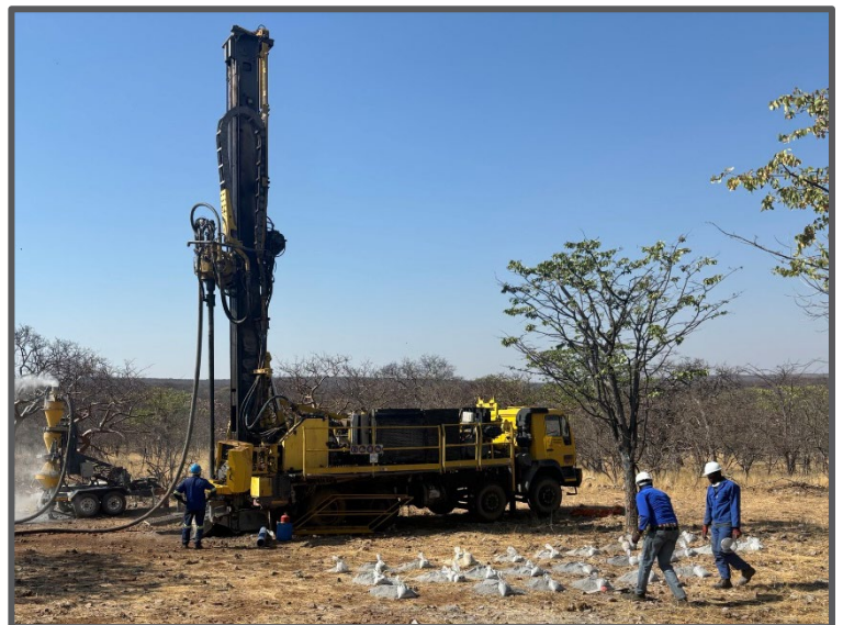
Figure 4. Drilling in progress at Kaoko.