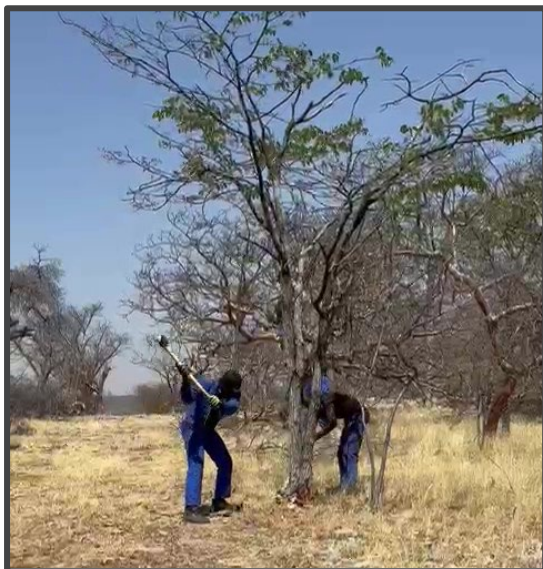
Figure 3. Hand clearing to provide drill rig access.

Following renewal of the Environmental Clearance Certificate (ECC) for exploration licence EPL6667 late in the June quarter, field preparations commenced to accommodate drilling activities (Figure 3). A team of local workers were employed to undertake line clearing and site preparation activities and will continue to provide assistance during the drilling programme (Figure 4).