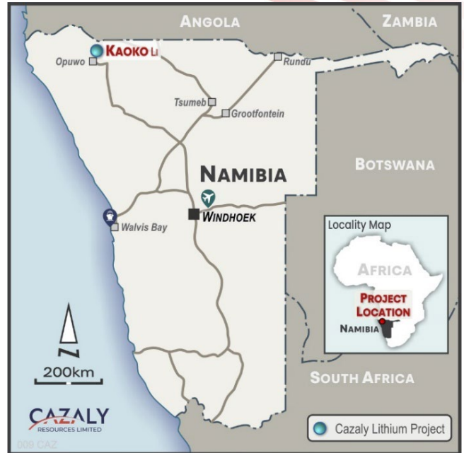
Figure 2. Location of the Kaoko lithium project.

The Kaoko lithium project is located approximately 800km by road from the capital of Windhoek and approximately 750km from the port of Walvis Bay (Figure 2). There is excellent infrastructure in the region with the project being only ~50 km from the regional capital of Opuwo, with an airport, good bitumen roads, and access to the 320 MW Ruacana hydroelectric power station. Transmission lines run through both the western and eastern parts of the project.